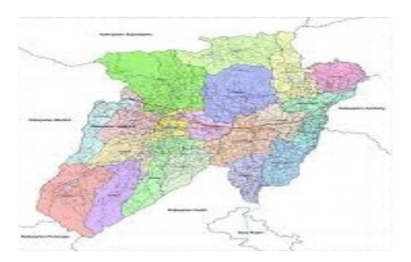
Figure 1. Map of Klagen location

Published by Hasanuddin University and Asian Rural Sociology Association