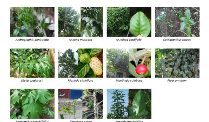
Figure 2. Traditional antidiabetic plants used by Baturraden and Sumbang people

The SUV of the cited plants ranged from 0.02 ( Tinospora crispa and Melia azedarach ) to 0.19 ( Piper ornatum ). At the same time, the RFC was also varied from 0.01 ( Melia azedarach and Muntingia calabura ) to 0.13 ( Piper ornatum ). Interestingly, the maximum FL of 100% was recorded for Smallanthus sonchifolius, Muntingia calabura, and Melia azedarach, while those of Vernonia amygdalina, Morinda citrifolia, and Annona muricata were not more than 20% (Table 2).