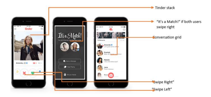
Figure A: Tinder Topography retrieved from http://bit.ly/2uNELbU, last accessed: 23/07/2017, 05.03 pm, London time

Tinder is a dating app that is geolocating and proximity-based allowing users to locate potential romantic partners who fall into their preferred criteria of gender and geolocation proximity (i.e. 0 - 21 km) (Sumter et al., 2017). "Swiping" is the common vernacular in this context which means physically dragging a profile to the right means an interest for interaction with the profile owner, and a drag to the left signifies otherwise.The figure above provides description of Tinder topography sequential process of "finding a match". Tinder users are given a "stack" of potential romantic-interests from which they can either swipe right or left depending of the users' interests. The "It's a Match" screen indicates that both show interests in each other. Only upon matching, conversation can begin.