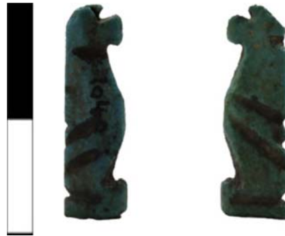
Fig. 4 - Amulet-bead which shows a baboon, found in the Eastern cemetery of Kerma, tomb K 1604 (NMS 1040)