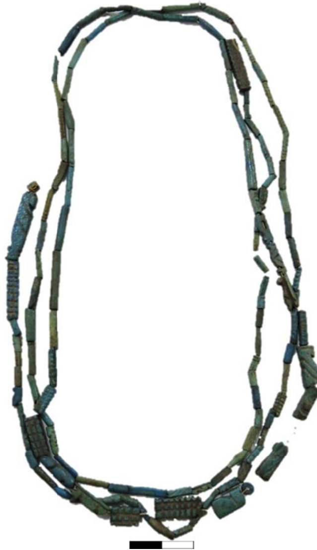
Fig. 2 - String of faïence beads and amulet-beads representing baboons (6), ladders (4), Tawret (16), and one hand, found in the Eastern cemetery of Kerma, tomb K 311 (NMS 1004)