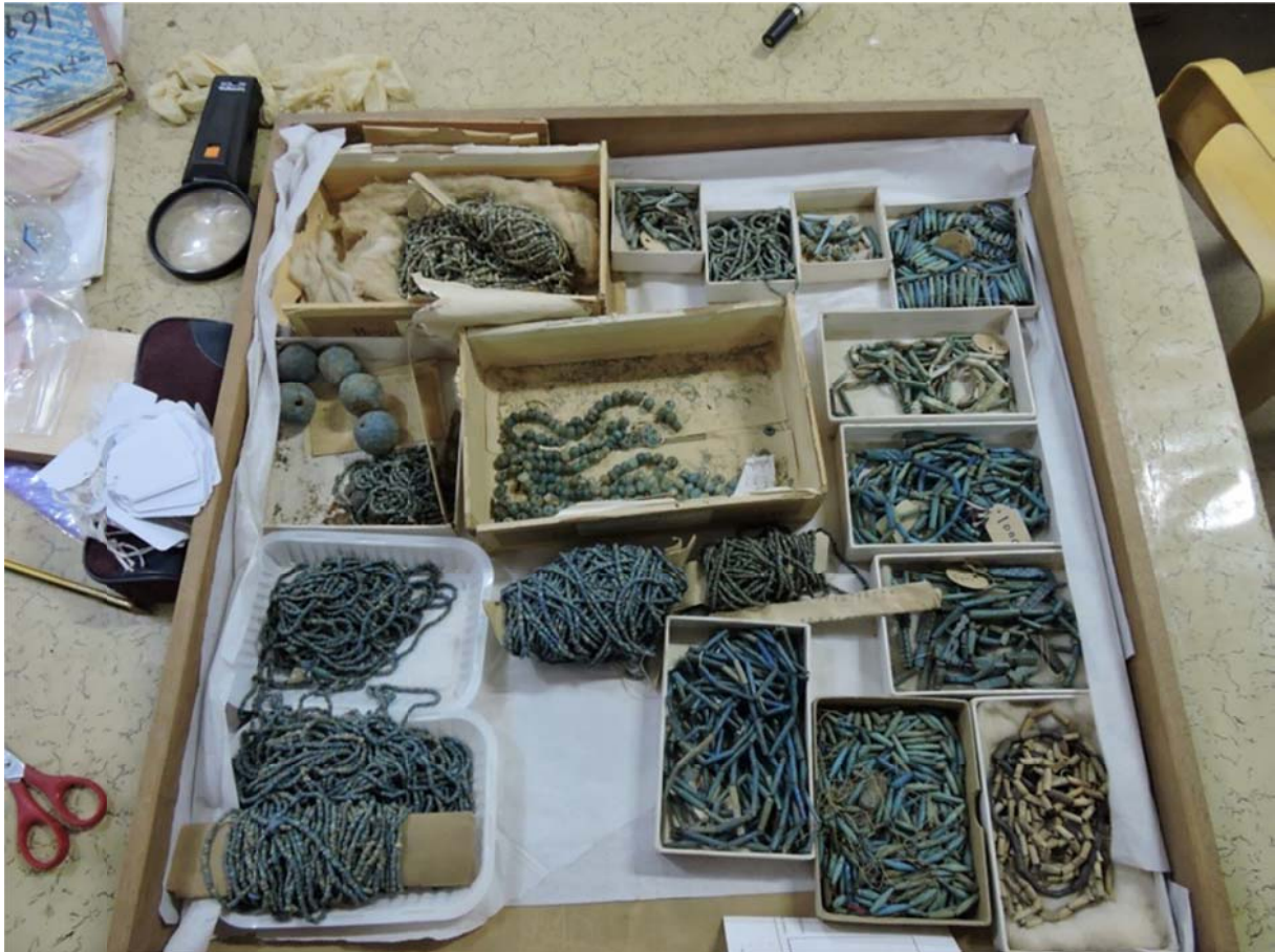
Fig. 1 - Faïence beads and amulet-beads collected by G.A. Reisner in the site of Kerma currently held in the storerooms of the National Museum of Sudan, Khartoum