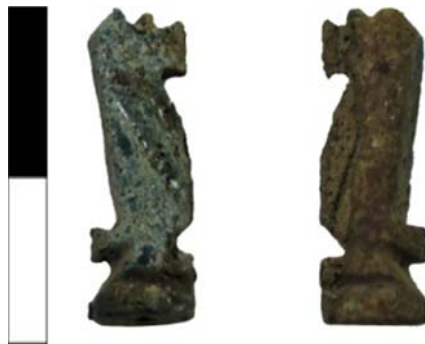
Fig. 5 - Amulet-bead representing Tawret, found in the Eastern cemetery of Kerma, tomb K 1600