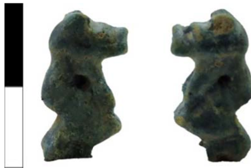
Fig. 3 - Amulet representing a hippopotamus in faïence , found in the site of Saras (NMS 22596)