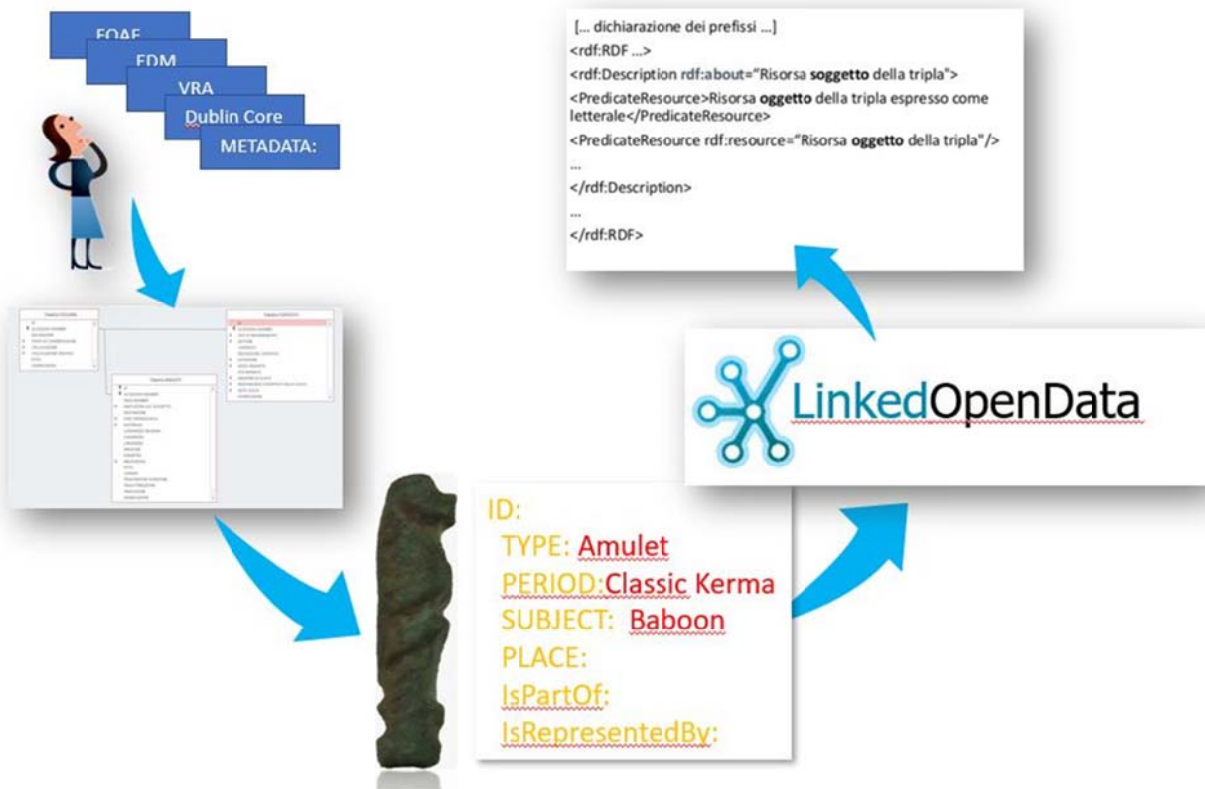
Fig. 6 - The workflow process of The amulets of the Kerma culture project