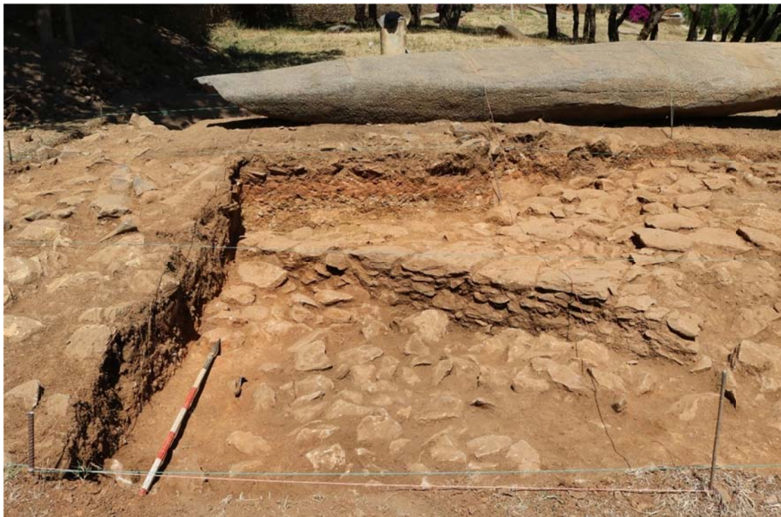
Fig. 6 - Excavation unit MHG I at the Northern Stelae Field, Aksum