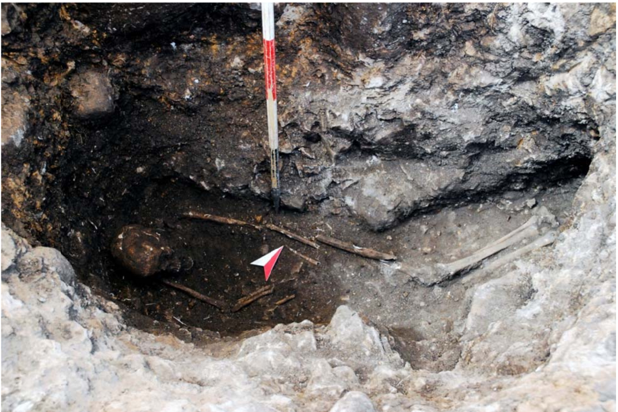
Fig. 4 - Skeleton in supine position at Tomb 33