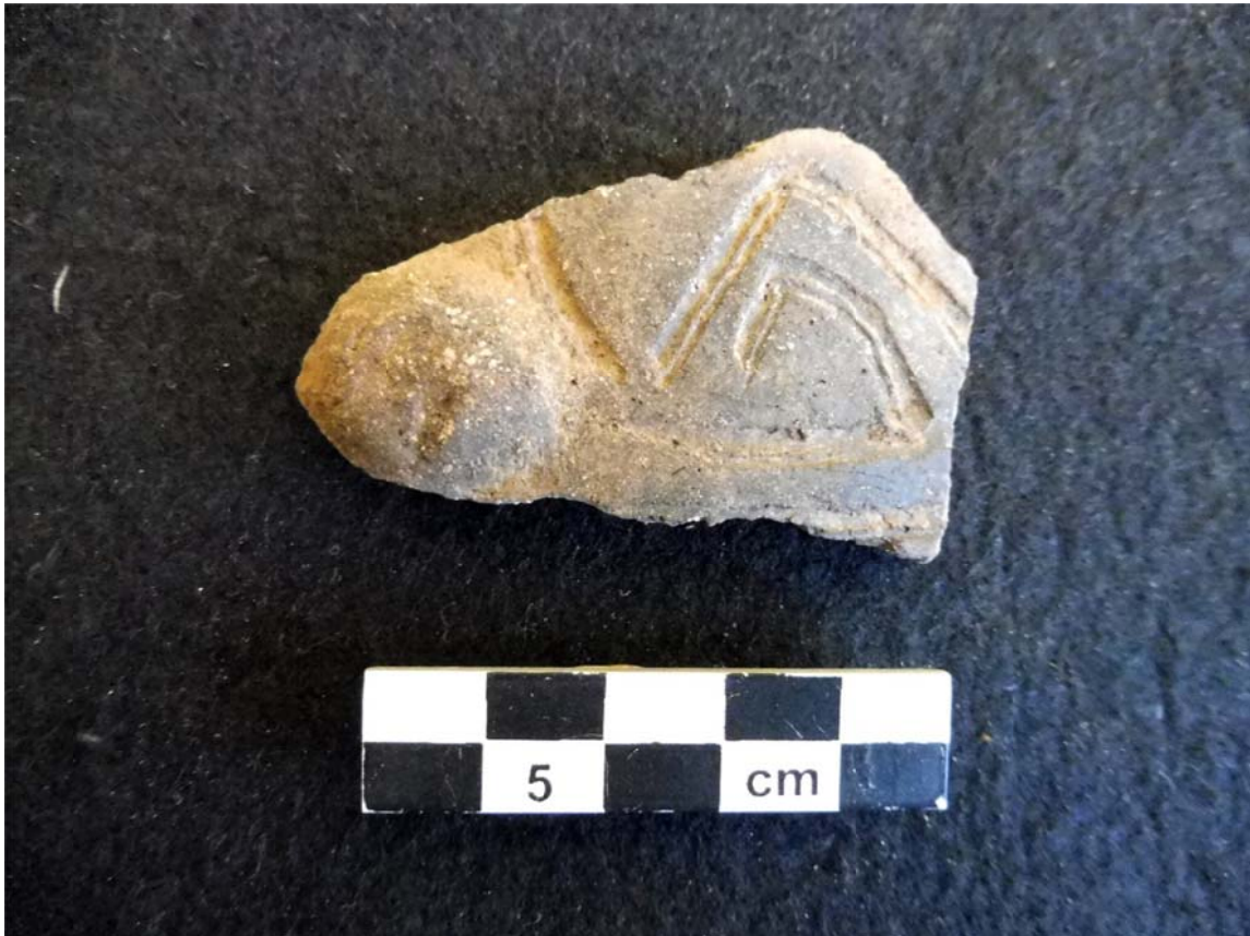
Fig. 5 - Fragment of a Gray Ware pot with incised wavy decoration from Tomb 33