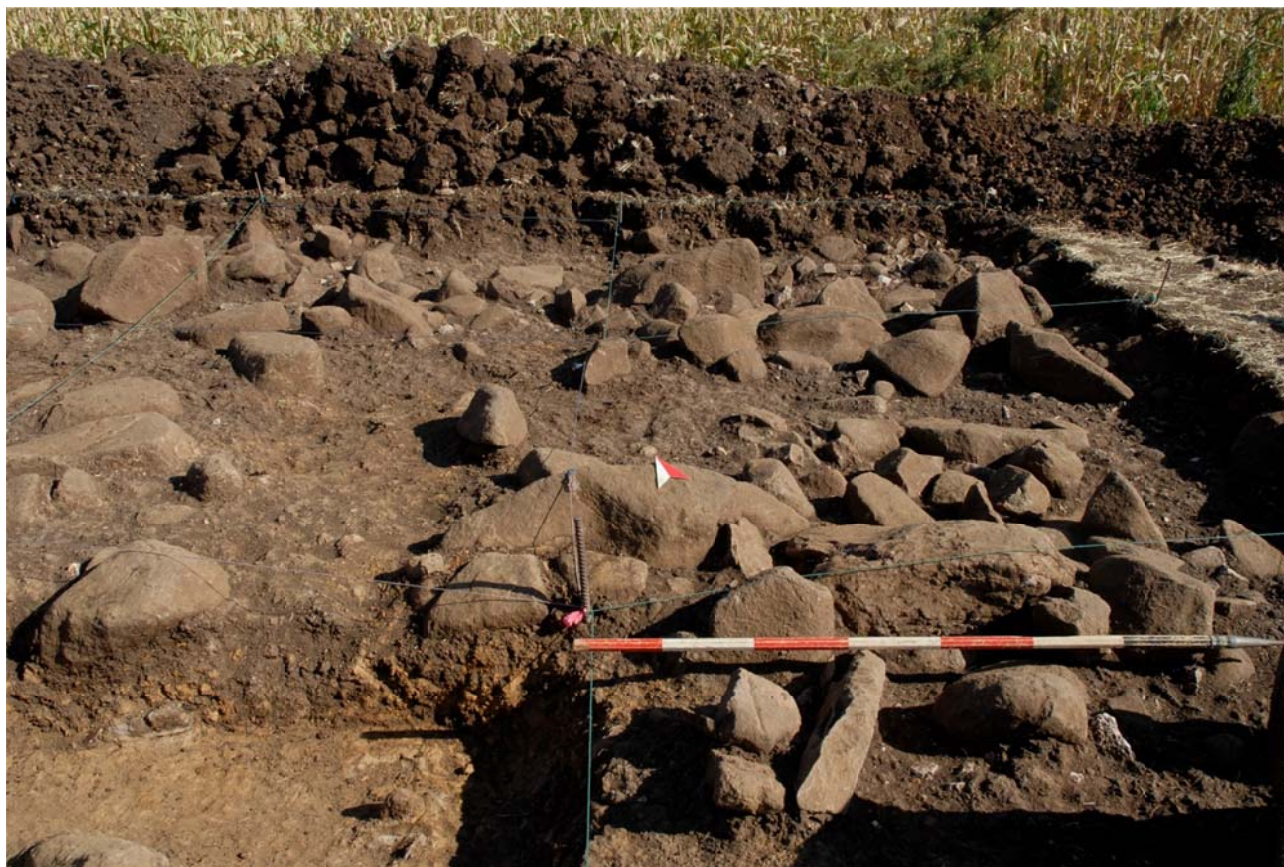
Fig. 7 - Remains of a stone made terrace in the northern sector of trench Seg XVII