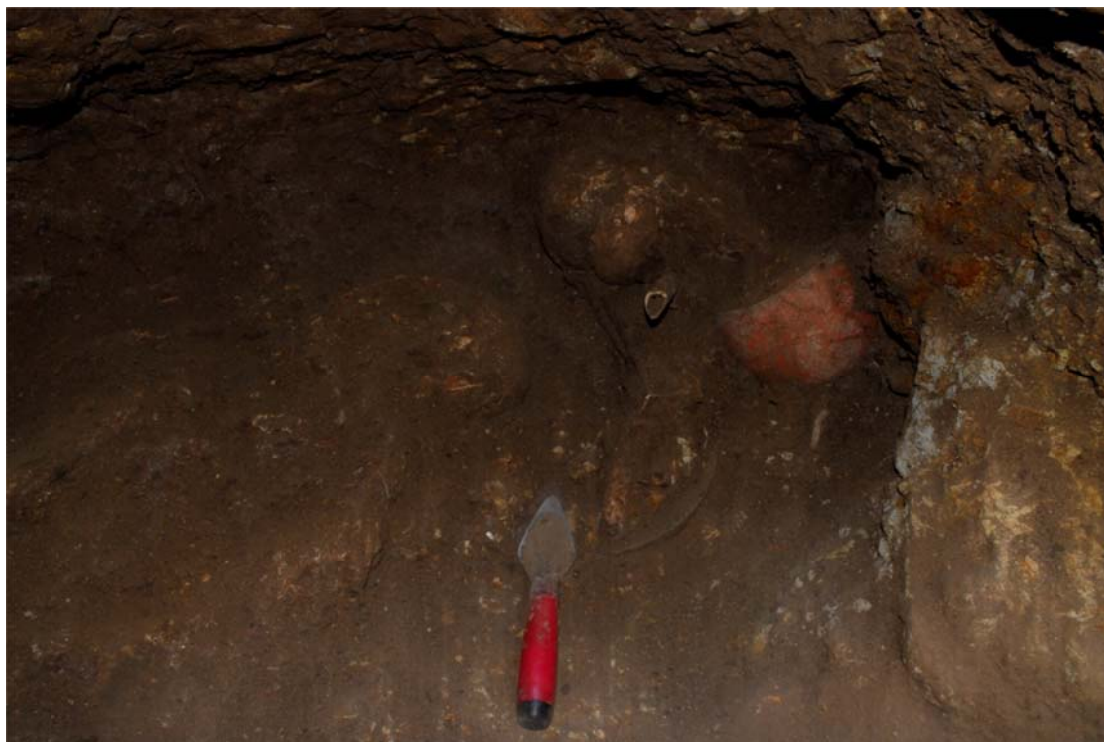
Fig. 2 - Side chamber of Tomb 31 with the skull and the upper part of the latest burial (center left) and some of the pots with bones from the previous inumations (right)