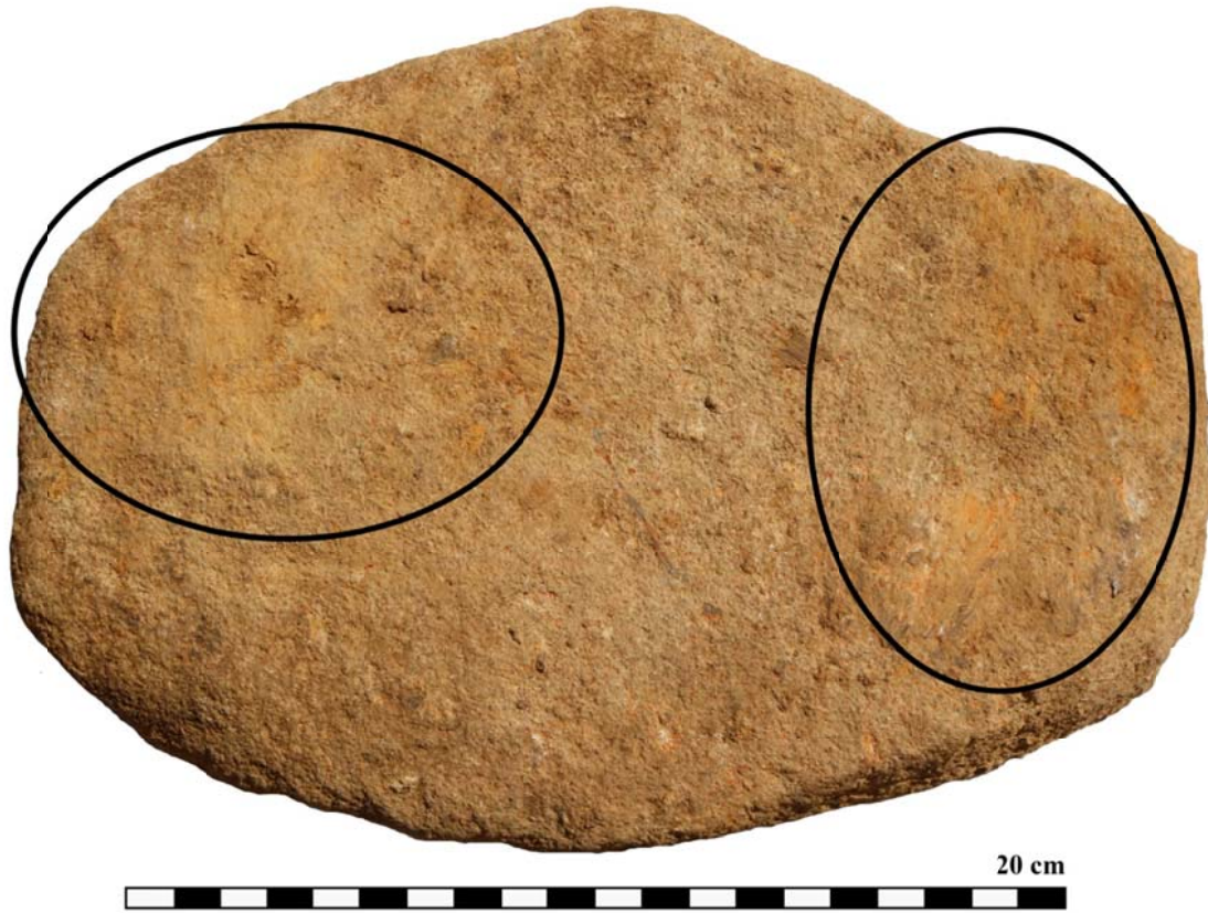
Fig. 3 - Working surface of a lower grindstone with residues of red pigment, from Tomb 31