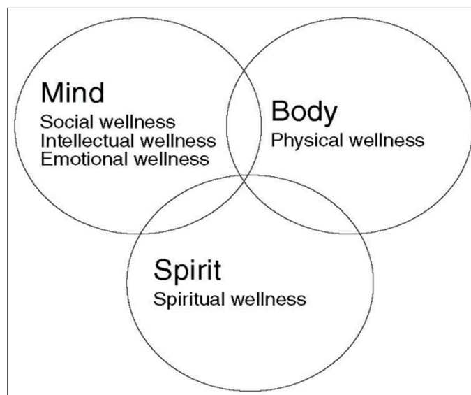
Figure 2 Mind, Body and Spirit: Dimension of Wellness

Based on Figure 1, Corbin et al. (2006) shows that there are five dimensions to achieving overall wellness through wellness dimensions. The five dimensions of wellness are as follows: emotional, spiritual, physical, social and intellectual. To achieve a balance of body, mind, spirit, each of these dimensions has their respective roles where it is influenced by each individual in maintaining and achieving wellness.