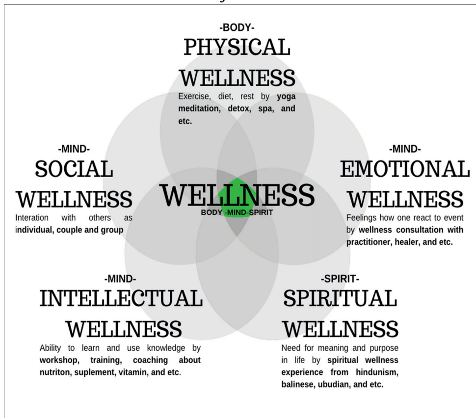
Figure 3 Dimension of Wellness di Ubud