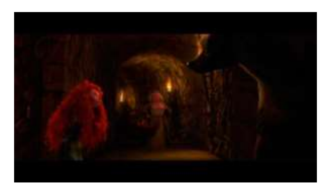
Figure 5. A Screenshot from Brave in Min. 00.42.47

Because Merida has passed through the gate to the special world, at this stage she would face a real adventure.