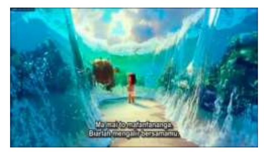
Figure 2. A sceenshot from Moana min. 00.06.21