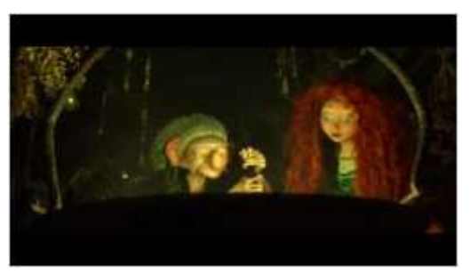
Figure 1. A screenshot from Brave (Min 00.34.51)