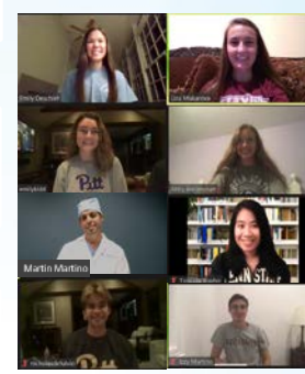
Screenshot of weekly team