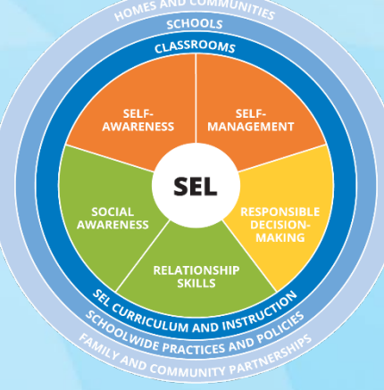
Figure 1. Social and emotional learning (SEL) competencies<sup>1</sup>