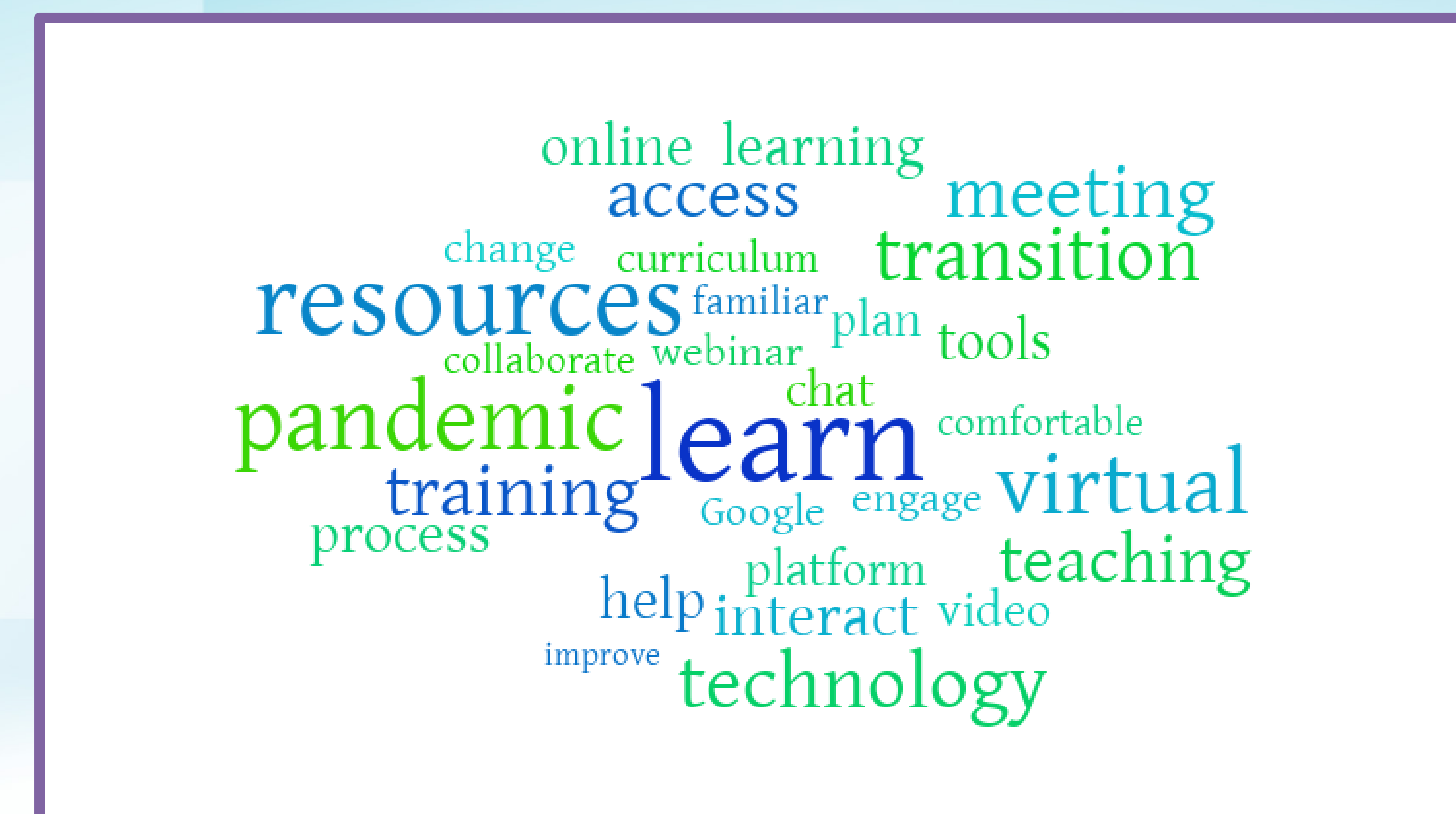
Figure 3. Word cloud in which the font size correlates to the frequency of the word spoken in follow-up interviews. Faculty themselves had to learn in order for their students to learn, so therefore the word "learn" was spoken most often.