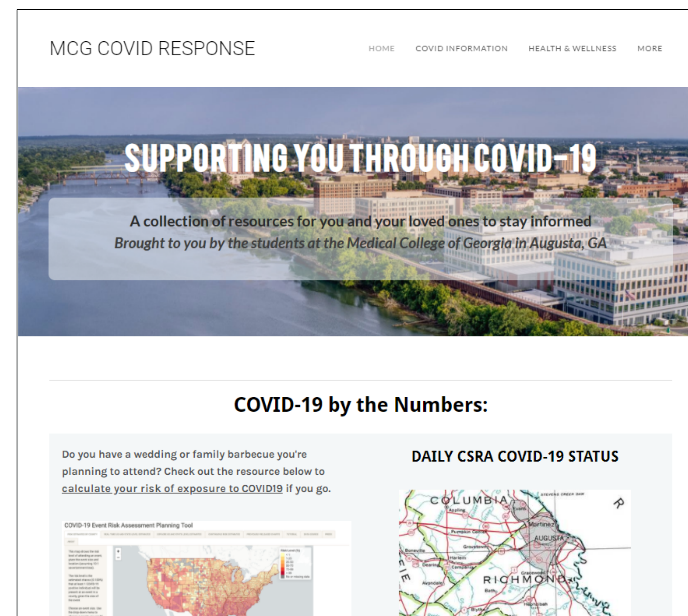
The website designed by the students in the course