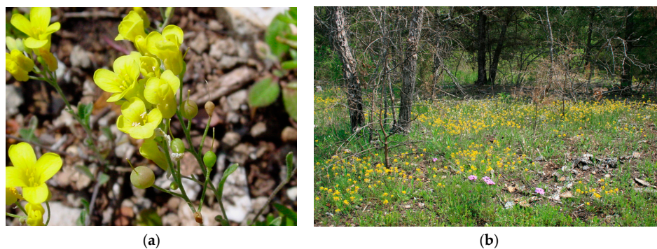
Figure 1. (a) Limestone glade bladderpod, Physaria filiformis , in flower; (b) Bladderpods in glade habitat.

As an example of smaller scale data sets, the Heartland Network of the National Park Service's Inventory and Monitoring Program (NPS I&M) monitors two threatened plant species: the limestone glade bladderpod, Physaria filiformis (Rollins) O'Kane and Al-Shehbaz (Figure 1), and the western prairie fringed orchid, Plantanthera praeclara Sheviak and Bowles (Figure 2). Primary objectives include estimation of population abundance (e.g., level 2 monitoring). Detailed monitoring protocols, along with standard operating procedures for data collection and management, have been developed for both the bladderpod [18] and the orchid [19]. Although the goals for conservation of the two species are similar, standard operating procedures vary due to differences in the two species' natural history and their population sizes.