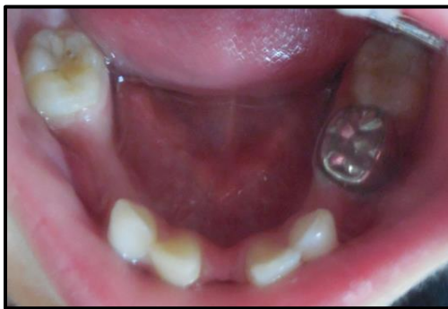
Figure 5. Intraoral photograph of mandibular arch showing restoration w.r.t 36,46 and stainless steel crown w.r.t 75

dental development is often delayed, as is orthodontic treatment. 9