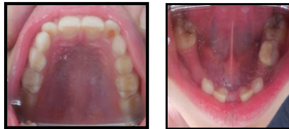
Figure 3. Pre-treatment Intraoral photographs showing missing teeth w.r.t mandibular arch (occlusal view).

Hypodontia carries an aesthetic, functional, psychosocial, and financial burden for affected