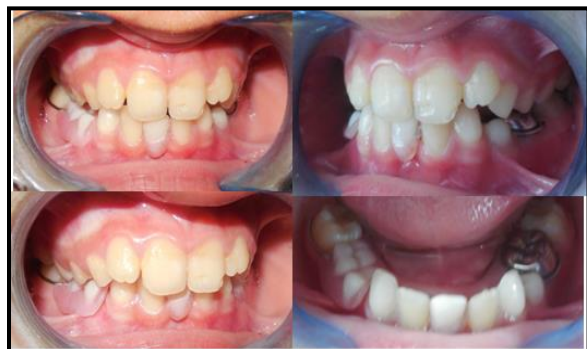
Figure 6. Post treatment Intraoral photographs showing insertion of functional space maintainer

In present case space maintenance was required till the permanent teeth erupts. Restoration of permanent teeth as well as stainless steel crown was given on deciduous second molar so that space maintenance can be done. Functional space maintainer was given to establish esthetics, function and for the preservation of space till all permanent teeth erupts.