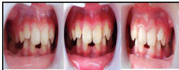
Figure 2. Pre-treatment Intraoral photographs showing deepening of occlusal bite and enamel hypoplasia w.r.t 21

Van der Woude syndrome. Complete set of investigations were done which included routine examination of blood including serum calcium, alkaline phosphate, TSH, T 3 , T 4 . The findings of these investigations were normal. During physical examination, no abnormality was observed with nails, perspiration and thickness of hairs, which ruled out ectodermal dysplasia; on ocular examination, no signs of glaucoma was seen ruling out Rieger syndrome and lastly there was no mucosal cysts in lips or cleft palate which ruled out Van Der Woude syndrome too. Finally based on above findings non syndromic Oligodontia as final diagnosis was justified.