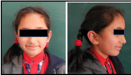
Figure 1. Pre-Treatment Extra-Oral Radiographs

Van der Woude syndrome. Complete set of investigations were done which included routine examination of blood including serum calcium, alkaline phosphate, TSH, T 3 , T 4 . The findings of these investigations were normal. During physical examination, no abnormality was observed with nails, perspiration and thickness of hairs, which ruled out ectodermal dysplasia; on ocular examination, no signs of glaucoma was seen ruling out Rieger syndrome and lastly there was no mucosal cysts in lips or cleft palate which ruled out Van Der Woude syndrome too. Finally based on above findings non syndromic Oligodontia as final diagnosis was justified.