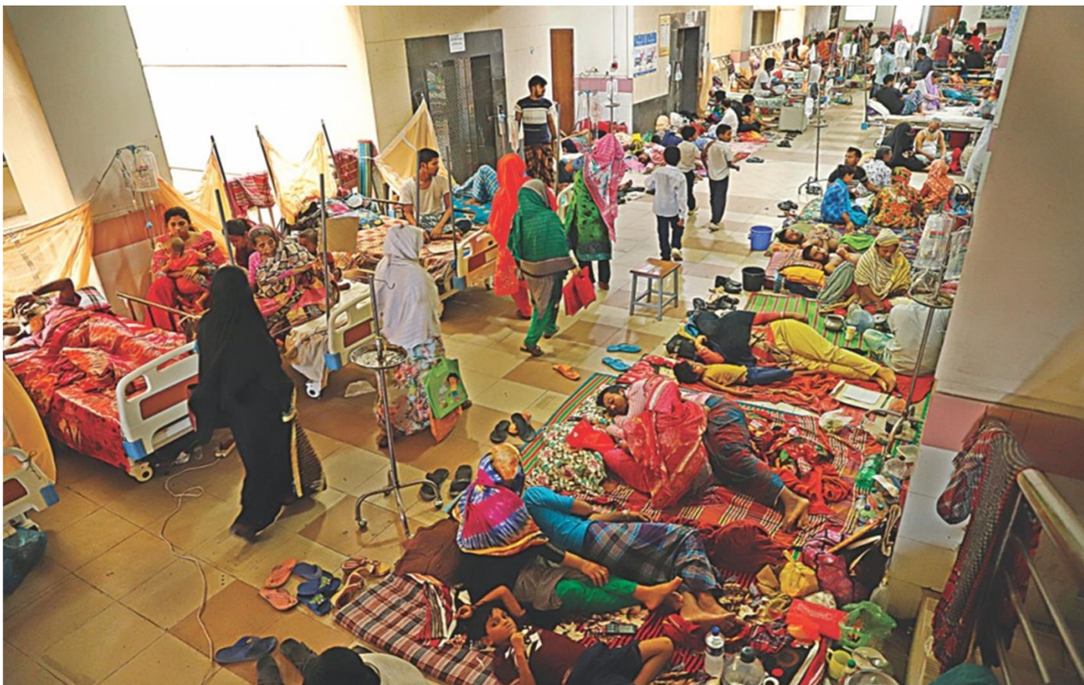
Figure 1. Patients' struggle in a private medical college indoor during a pandemic situation in 2019 1

Harvard Professor Sue Goldie credited Bangladesh with reducing child mortality by 80%, the highest in South Asia and targeting the reduction of the 1990 maternal mortality ratio by three quarters in the 2015-MDG5 target. 18 According to WHO, the current doctor-patient ratio in Bangladesh is only 5.26 to 10,000, which places the country second from the bottom, among the countries of South Asia. 19 According to the Bangladesh Medical and Dental Council, there were 25,739 registered male doctors in the country between 2006 and 2018 (47%) and 28,425 female doctors (53%). 20 Average consultation length is used as an outcome indicator in the primary care monitoring tool which was found a less than a minute to an outdoor patient. 5 An average 1.5 hours is to spend to see a doctor in Dhaka Medical College and other public hospital outdoors, sometimes there are no doctors due to post vacancy. 21-23 Patients' struggle for essential services during any disease outbreak in hospital indoor and outdoor is common (Figure 1). Overall, 67% of the healthcare cost is being paid by people, whereas global