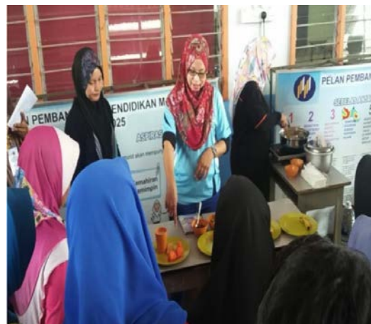
Figure 4. Healthy food preparation demonstration by the volunteers to the community.