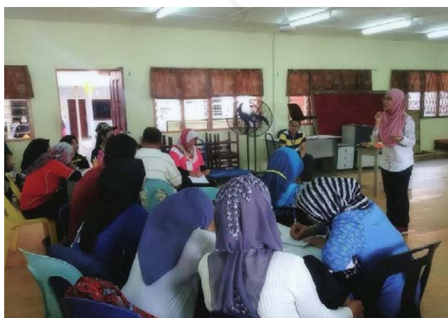
Figure 3. Knowledge sharing between trainers and the community volunteers in one of the training workshop sessions.

One unique distinguishing factor of this developed training module is that it places additional emphasis on psychological issues, which are not prioritised in the IMCI framework. Psychological stigma towards PTB has been a subject of interest not only to healthcare professionals but also to governing authorities. Casual transmission as a mode of contagion spread is one big factor within public stigma towards TB. 16 This stigma can be ascribed through three attributes; controllability (one's aptitude for controlling tuberculosis from infecting others), responsibility (being responsible on the infection such as compliance towards treatment), and blame (accepting that the infection occurred due to own fault). 17 To alleviate such public stigma, it would be highly relevant to integrate psychological domains as part of the training module.