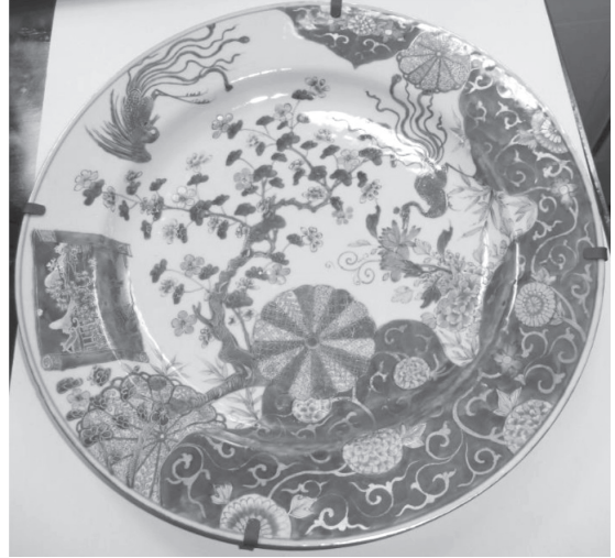
A Japanese plate 47 cm diameter, in the collection of Detmold castle, believed to have been brought back by Kaempfer from Japan. The voluptuous decoration with birds, a landscape (left rim) cherry blossoms and chrysanthemums is geared towards European taste.