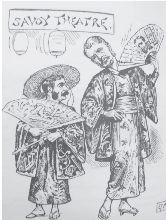
Caricature of Sullivan (left) and Gilbert (right) by E.J. Wheeler Punch , March 28, 1885.

proposal, a story revolving around a magic lozenge, did not find the approval of Sullivan who desired a more sophisticated subject for his music. But then, in May of that year, a Japanese sword Gilbert had fixed to the wall apparently caught his eye and the idea of using Japan as backdrop for the next opera, The Mikado or Town of Titibu , was born.