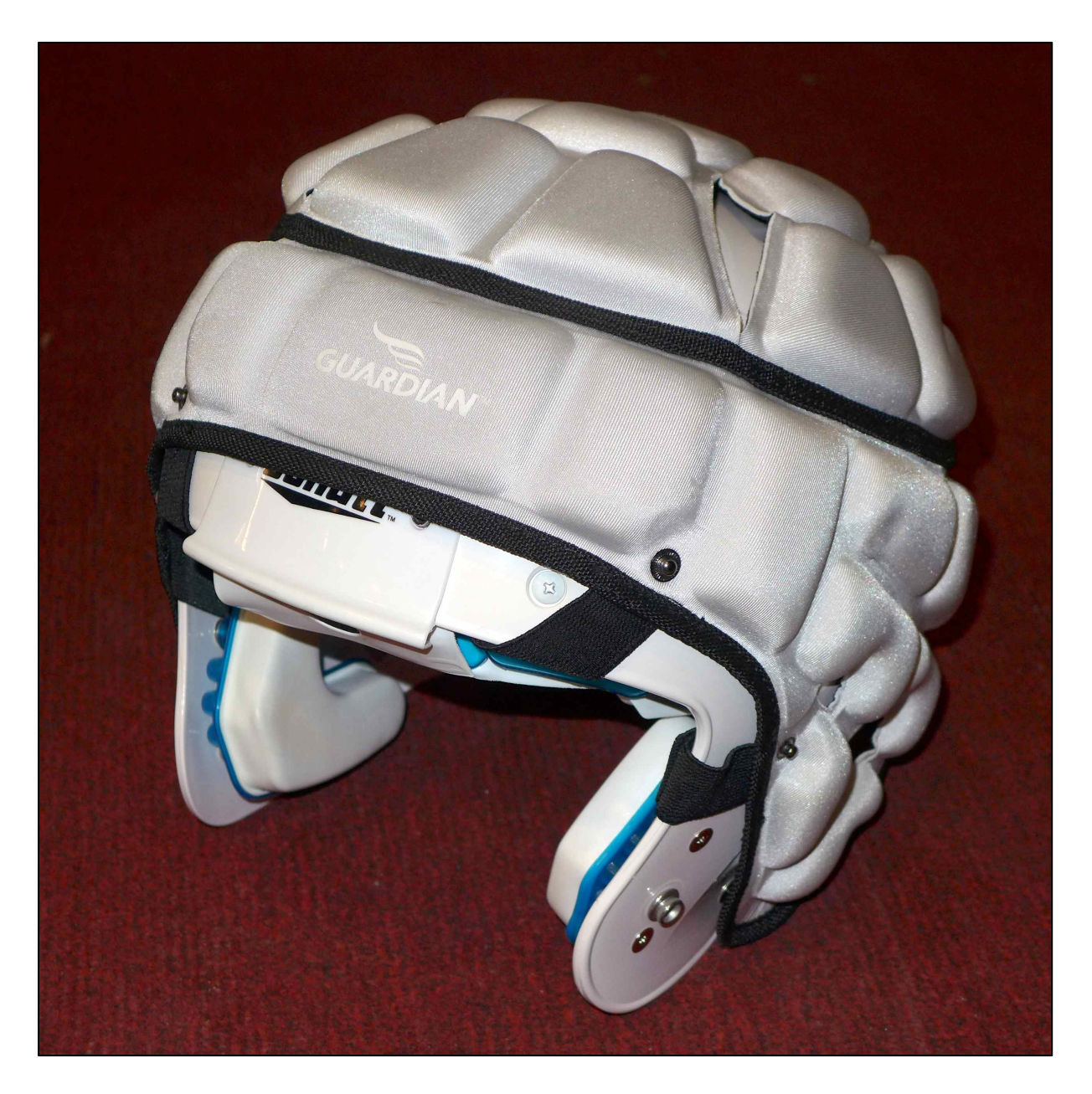
Figure 1. Guardian Cap attached to Schutt football helmet.

The NOCSAE headforms are biofidelic headforms that come in three sizes: small, medium, and large. Full description and specifications of the NOCSAE headforms is found in Standard test method and equipment used in evaluating the performance characteristics of