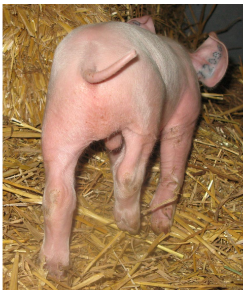
Figure 4.1. Image a piglet of 25 days of age that underwent tail docking and tattooing the day after birth and surgical castration at 5 days of age.

utilitarian ethics. In addition, insensitivity to pain in very young animals has historically been used as an argument to carry out painful procedures at this early life stage. However, the weight of scientific evidence now shows that very young piglets, similarly to neonates from other mammalian species, are able to experience pain (EFSA, 2017) even though there may be variations with age in sensitivity to noxious stimuli (Kells et al. , 2019).