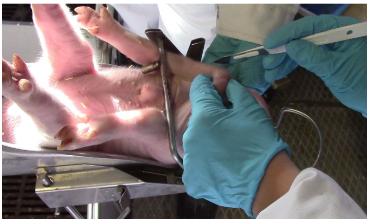
Figure 4.2. Image of a piglet restrained for surgical castration.

Across the world, most male piglets still undergo surgical castration. For example, nowadays in China nearly all pigs are surgically castrated (Xue et al. , 2019), and in 2015 in the EU-24 61% of male piglets were surgically castrated (De Briyne et al. , 2016). The main reasons are rearing less aggressive animals, avoiding pregnancy if males are housed with females and, more importantly, avoiding boar taint (e.g. unpleasant odours and flavours of entire male pig meat) (EFSA, 2004). Surgical castration of male piglets is performed during the first days or weeks after birth. It is a rapid process that may take less than 30 seconds, including the time for catching the animal, if no pain mitigation is performed. Piglets are restrained during surgery to minimize movements (Figure 4.2). One or two incisions of about 2 cm are made through the scrotum and surrounding tissues are trimmed to free each testicle. Thereafter, each testis is extracted and removed