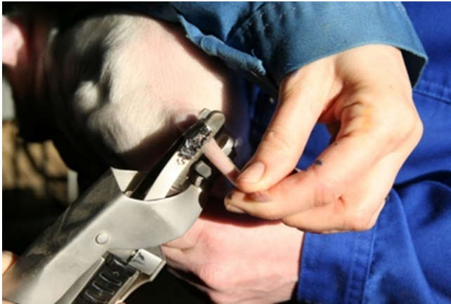
Figure 4.4. Image of a piglet during tail docking with a hot iron apparatus.

was recently demonstrated using transmission electron microscopy (TEM) in dorsal and ventral tail caudal nerves in 3-day-old piglets (Carr et al. , 2015), confirming that tail docking can most definitely cause pain.