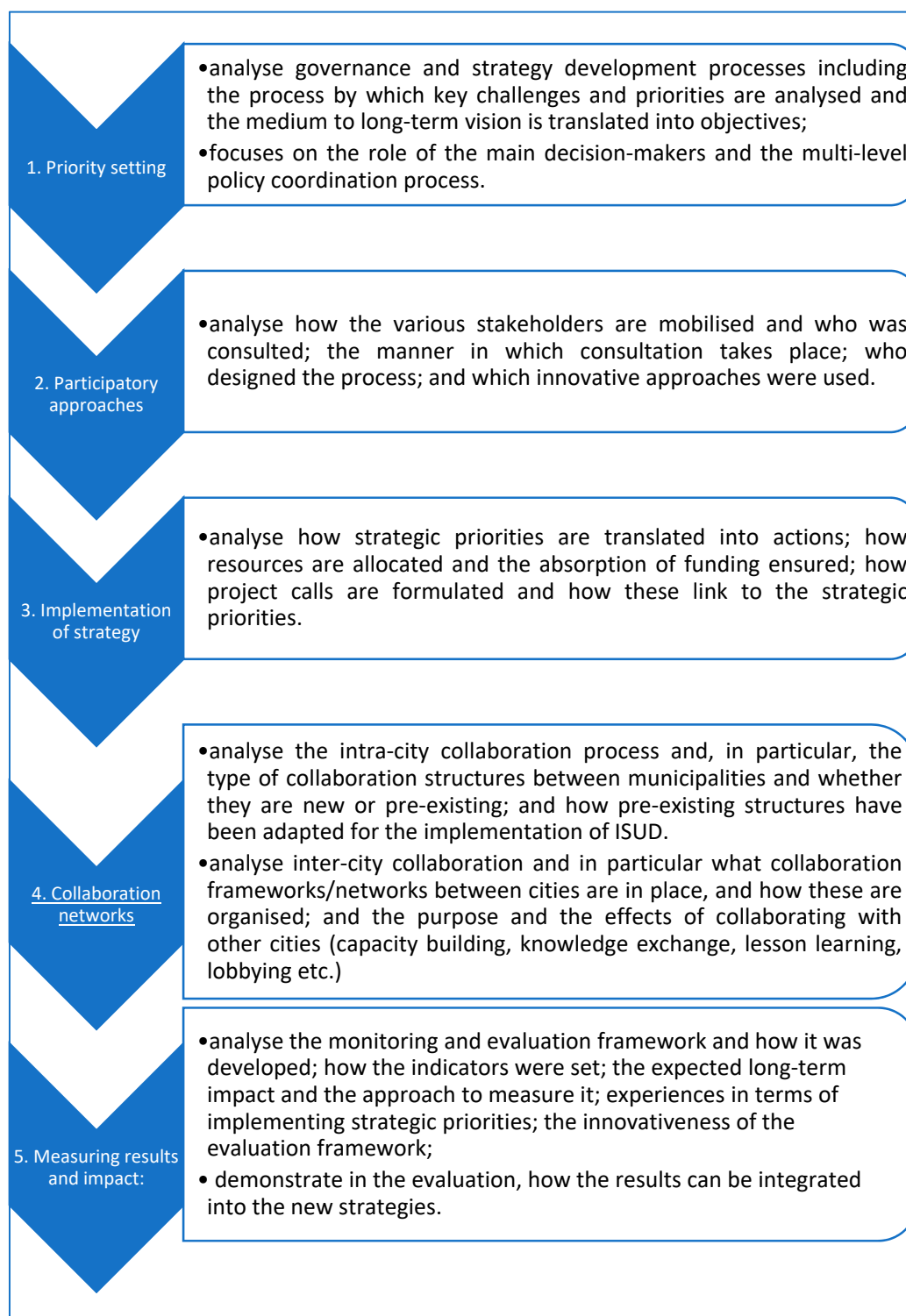
Figure 1. Analytic framework to assess the implementation of the Integrated Strategies for Sustainable Urban Development (ISUD). Own elaboration.

tourists [18]. Conversely, Évora is an eloquent example of an historic and attractive (touristic-wise) medium-sized city in a vast depopulated territory, suffering from systematic depopulation and aging trends in its historic centre.