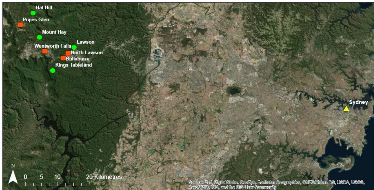
Figure 1. Locations of Blue Mountains Upland Swamps (BMUS) study sites. Sites are located within the Blue Mountains region (indicated in dark green), containing the Blue Mountains World Heritage area, which is located to the west of Sydney, NSW, Australia and the urban Sydney catchment area (grey). Urban swamp catchments are indicated using orange squares and naturally vegetated catchments are shown using light green circles.