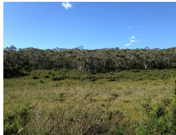
Figure 5. Naturally vegetated BMUS dominated by native sedges and shrubs.

BMUS provide a unique case study to explore the effects of catchment urbanization and