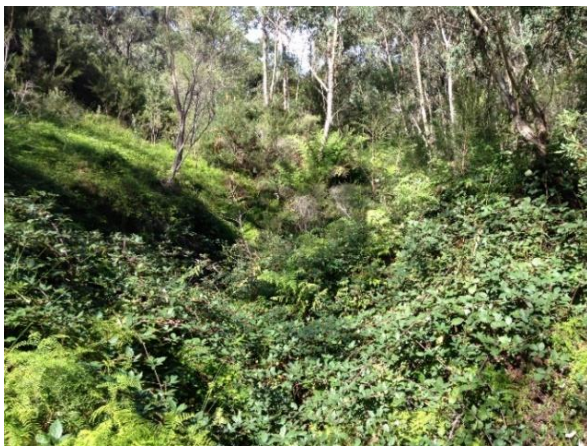
Figure 4. Urban BMUS dominated by weed species including blackberry.

Modifying the chemical environment can also impact physical and biological components of freshwater systems, including enhancing erosion and sedimentation [3], and facilitating weed invasions via increased nutrients, which can contribute to altered community composition and biodiversity loss [4]. Weed invasions are a concern in urban BMUS and increased surface runoff contributes to altered geomorphology, removal of preferential drainage lines and channelization, which impairs swamp functioning [16]. For example, urban swamps were observed to have a distinct channel and be dominated by exotic species (figure 4), such as honeysuckle ( Lonicera japonica ), small-leaved privet ( Ligustrum sinense ) and blackberry ( Rubus fruticosus ), however weed species were not present in non-urban swamps (figure 5).