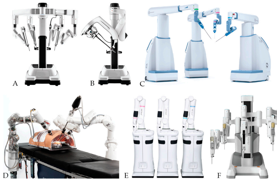
Figure 2. Patient carts. (A) da Vinci Xi [90], (B) da Vinci SP [90], (C) Senhence [5], (D) MiroSurge [63], (E) Versius [92] and (F) Revo-I [91].