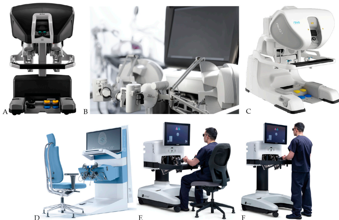
Figure 1. Surgeons consoles. (A) da Vinci [90], (B) MiroSurge [63], (C) Revo-I [91] (D) Senhence [5], (E) Versius seated and (F) standing [92].

In addition to the foot pedals, other axillary controls are included on many RAS systems; these have many different uses. The da Vinci RAS system includes two additional panels which are located either side of the surgeon allowing adjustment of motion scaling, endoscope calibration as well as system controls such as start, emergency stop and standby [18]. Some later versions of da Vinci include a touch screen display for setting up preferences and operating parameters [58]. The Revo-I RAS system has two emergency stop buttons, one on the right hand side of the surgeons console, and the other on the surgical cart [24]. Senhence include a full size keyboard, however it's utility is unknown [55].