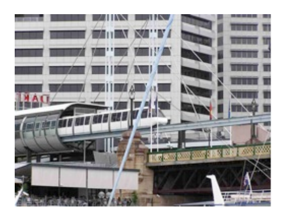
Plate 3: Urban Playground, Darling Harbour, A.P. 2004