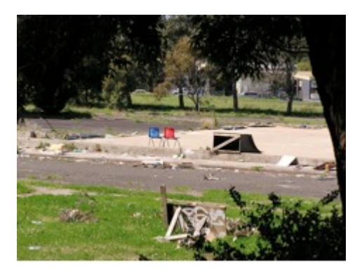
Plate 12: Uncanny Shadow-lands, Abandoned Land, Sutherland A.P. 2007

The writer suggests that disturbing landscapes in the city are uncanny shadowlands where shadows are the Jungian archetype of our 'other'. They are places on the margins such as the area around drainage culverts, old quarry faces, and spaces cut off or under motorways. An eerie presence also hovers around empty parking areas, rundown shopping malls and abandoned petrol stations.