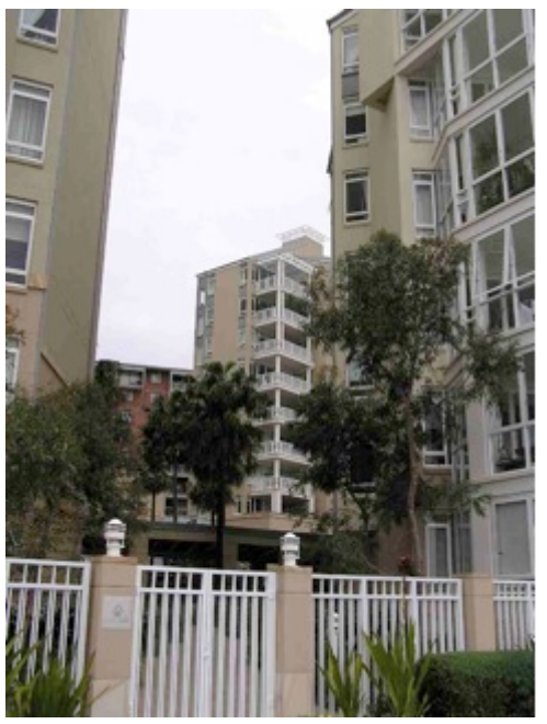
Plate8: New Fortified Harbourside Residential Areas A.P. 2004

It is the subtle and familiar qualities that are disappearing; things that are often only noticed by a child. The inner suburbs of Sydney have, until recently, been rich in small left over spaces. Many of the streets in Sydney's foreshore suburbs ran down steep slopes only to be truncated by the Harbour, where they often turn into makeshift parks, merely as wide as the street.