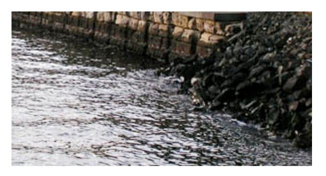
Plate 7: Childhood Waterside Places, A.P. 2010