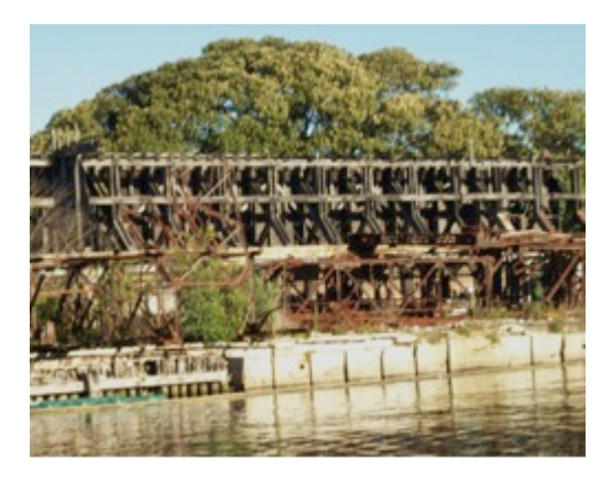
Plate 5: Disorder in the city Blackwattle Bay, Sydney A.P. 2008

Spectacle and tourism-driven economics, as well as new urban living in emerging high-rise precincts, are seen as the panacea for post-industrial cities. Since the early 1980s planners and designers have been dominated by such neo-liberal utopianism in a desire to escape the dystopia of post-industrial ruins. Some contemporary theorists question this naïve utopian planning because it ignores the contributions within dystopias; in particular, learning to live with disorder and diversity (Kraftl 2007:120-138).