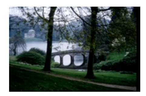
Plate 1: The Allegory in Stourhead, A.P. 1993

Matthew Potteiger and Jamie Purinton in their book, Narrating Landscapes , suggest that landscapes and places can be considered as narratives (1998). Keen to go beyond literal representations in the landscape, Potteiger and Purinton consider that there are equally narratives implicit in materials and in processes (1998: x). One can thus draw from literary theory the "metaphor of landscape as text", the idea of inter-textual connections, multiple authorships and the role of the reader in constructing meanings (Potteiger and Purinton 1998: x). The context of the narrative acts as a boundary while also orienting the 'reader' to the kinds of story world they are entering; to give a designed landscape example, contrast entering the allegory within the 18th century garden to being hurled into the chaotic layering of a contemporary textual landscape, the Garden of Australian Dreams in the Museum of Australia, Canberra.