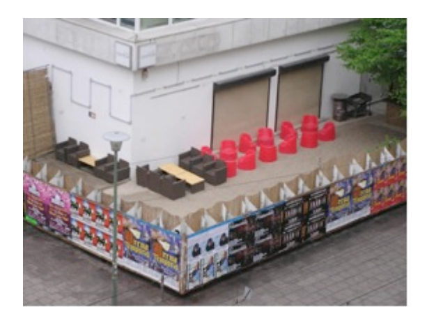
Plate 6: Culture of the Makeshift, Berlin A.P. 2009

and people? They are certainly evident in the marginal landscapes of shrinking cities such as the innovative way abandoned lands are being used in Berlin and Detroit. But they are also in resilient cities that allow for complexity.