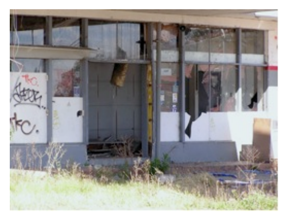
Plate 13: Seductive Melancholy, Eroticism of Danger, A.P. 2008

... they can jolt us with strange aromas, often emanating from dumped rubbish along tracks that seem to lead nowhere. An old faded fabric, twisted and soiled, strewn near a log, hints at something sinister; arousing a shiver of unease. A broken washing machine, rust etching into its white surface, leans abused and abject; metal cans, discarded car parts – strange disconnected objects – reveal an abstract beauty..." (Armstrong, 2010: p 30)