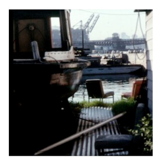
Plate 11: A Place for Reflection, Former Working Bay, Glebe A.P. 1995

Through this process, the city with patina – a mosaic of light and dark places, complex and layered and rich with possibilities – is being lost. The city with patina is not afraid to remember. It is not afraid of disturbing uncanny places.