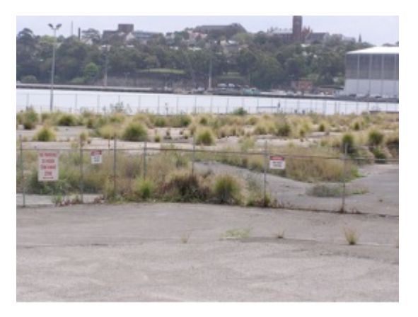
Plate 10: Places for Childhood Adventure, Sydney. A.P. 2008