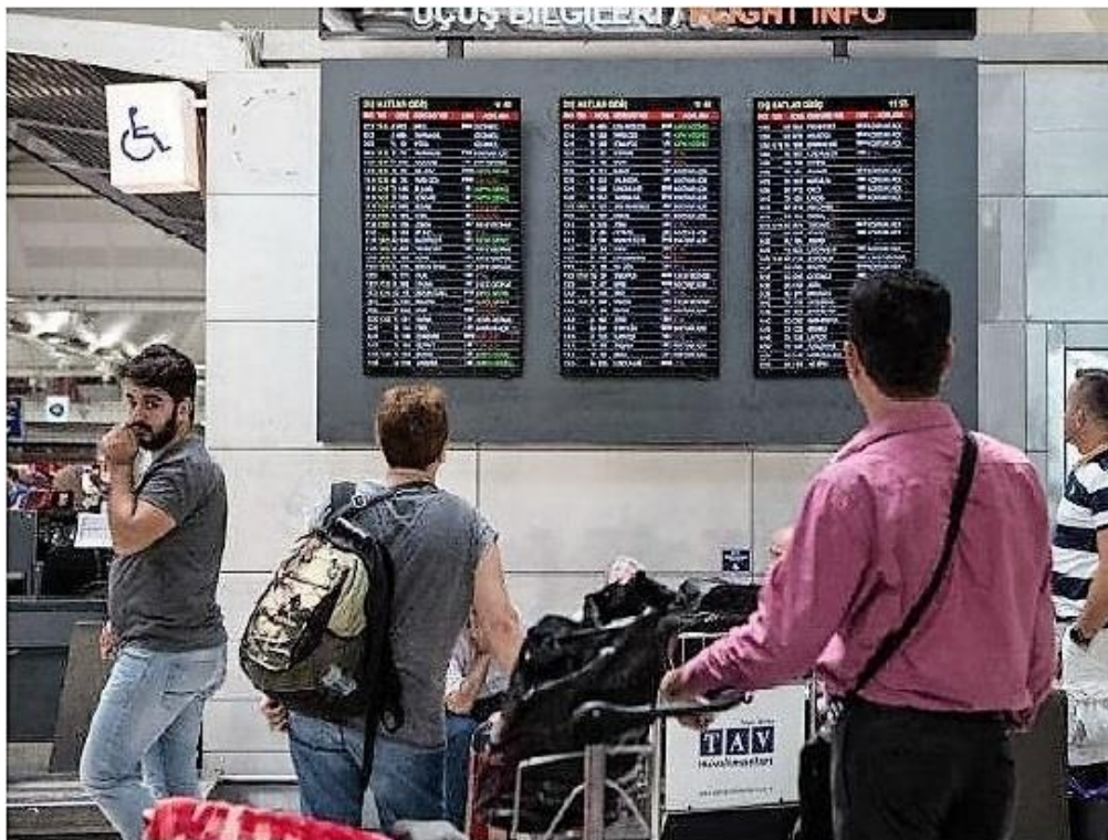
Passengers check the board shows status of flights at the country's largest airport, Istanbul Ataturk, following yesterday's blast.

A Turkish official, speaking on condition of anonymity, said five of the dead were from Saudi Arabia, two were from Iraq, and one from Tunisia, Uzbekistan, China, Iran, Ukraine and Jordan.