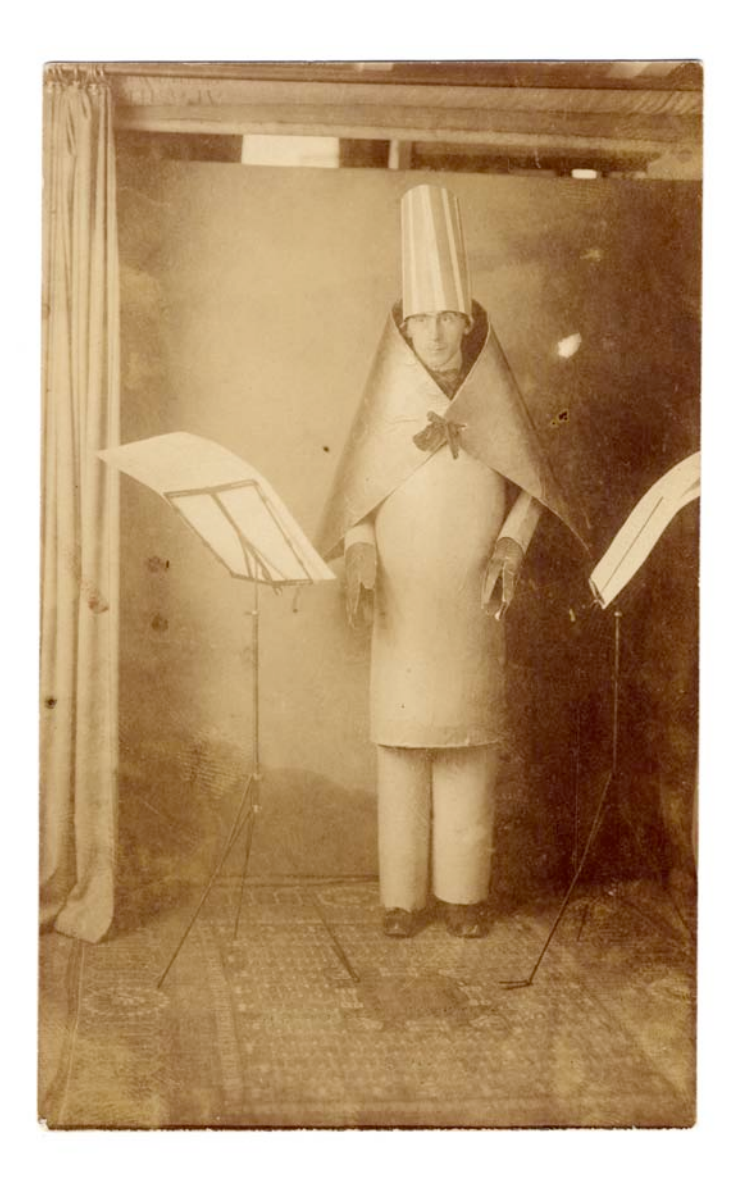
Illustration: Hugo Ball

The photograph of Hugo Ball, dressed in cardboard costume and conical hat, reciting the sound poem Karawane at a Cabaret Voltaire soirée, before being carried off stage in quasi-religious paroxysm, has achieved iconic status in the history of Dada. It is a-if not the -quintessential image of Zurich Dada. Ball's image, reproduced countless times, embodies and mythologizes the Dada cabaret and its innovation of sound poetry. It is scarcely surprising that the photograph is treasured, granting as it does a glimpse into Dada performances that have become infamous but remain irretrievable.