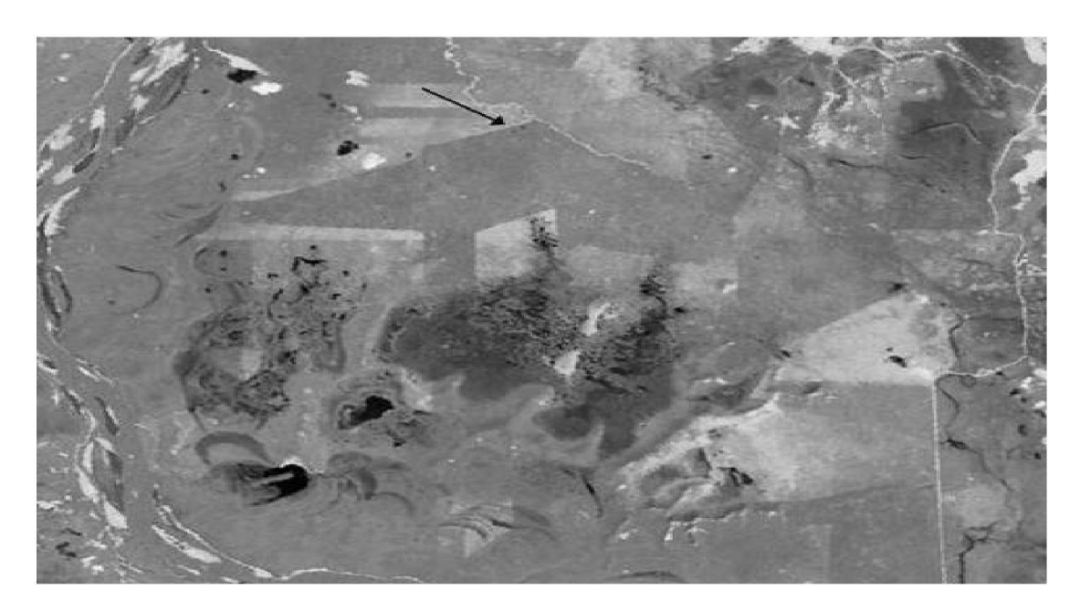
Fig. 3. The RGB combination of the Landsat TM 5 image bands 2, 3 and 4 presenting part of the study area. The Yellow River with white sand banks is on the left side of the picture. At the point of arrow is a fence between the winter and summer pasture (see Fig. 2 which is taken from this point). The road from the south to the north is on the right.