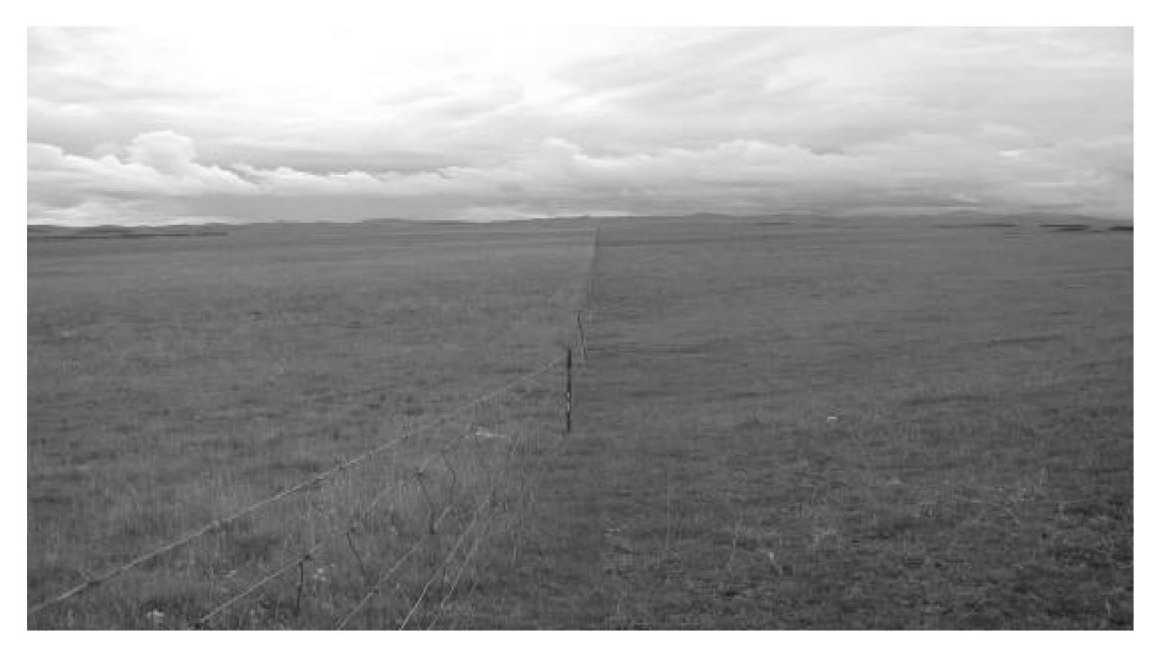
Fig. 2. A fence dividing winter and summer pastures near the Yellow River. A tall grass meadow is on the left and short grass meadow on the right. These borders are also visible in the Landsat TM 5 image (see Fig. 3).