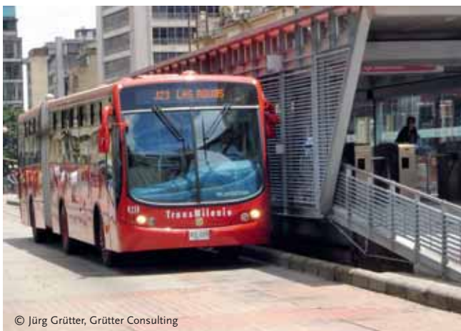
FIGURE 3: High investments in sustainable projects like bus rapid transit (Bogotá, Colombia) ...