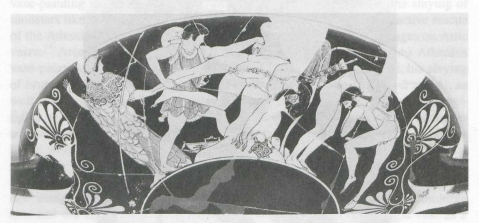
Fig. 2: Theseus and Skiron, Theseus and Kerkyon. Attic 'cycle'-cup with deeds of Theseus (around 490/80 BCE), London, British Museum E 48 (photograph after Corpus Vasorum Antiquo-rum, Great Britain 17, The British Museum 9 , London 1993, pl. 27 b).

building's south side in order to change the 'message' of the treasury and to make it, indeed, a victory monument for Marathon. <sup>19</sup> If this is true, the Athenians started to erect their splendid marble treasury at Delphi in the decade after their revolutionary political reforms under Kleisthenes and after the first great victory of their newly organised hoplite forces in 507/6, <sup>20</sup> at a time when they also started to rebuild their Athena temples on the late archaic acropolis at Athens. <sup>21</sup>