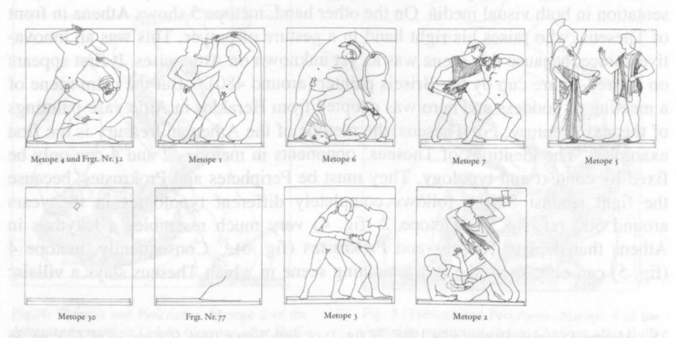
Fig. 3: Deeds of Theseus. South metopes of the Athenian treasury at Delphi (drawing after Hoffelner 1988, Beilage 5).

ard Neer has recently underlined, the Athenian and the panhellenic hero were juxtaposed at Delphi to highlight Athens' claim of special relationships to both. But if both appear, what were their different roles and how were these roles divided? Four sets of metopes belonging to the Athenian treasury, each with a different mythological theme, are preserved. Herakles and Geryoneus belong to the western rear of the building. The communis opinio arranges Herakles' other deeds above the north side, Theseus' deeds (fig. 3) above the south side and both heroes' (or only Theseus') amazonomachy above the building's east side, the side of the treasury's entrance. Every visitor will see the south side first as he approaches the