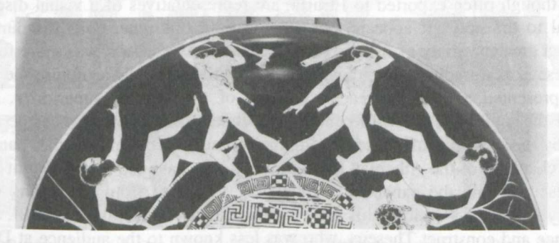
Fig. 7: Theseus and Prokrustes, Theseus and Skiron. Attic 'cycle'-cup with deeds of Theseus (around 440/30 BCE). London, British Museum E 84.

I have mentioned (and argued elsewhere) that in Attic vase-painting Theseus' final stroke with a weapon high above his head became dominant shortly before the middle of the fifth century, despite a few forerunners around 500. As of around 450, some of Theseus' deeds have changed typology almost completely, like his victory over Skiron or Prokrustes (fig. 7). Theseus is now able to defeat these villains by confidently using their possessions as weapons in a final blow – and no longer in a truly competitive, equal physical fight like before.<sup>37</sup> Hence, the idea of Theseus as an invincible, self-confident victor, cautiously presented in the