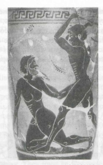
Fig. 6: Theseus and Prokrustes, Attic lekythos (around 500/490 BCE). Athens, National Museum Inv. 515 (photograph after Hoffelner 1988, fig. 32)

Hence, although this iconography was known in vase-painting in the years around 500, in this medium it did not have any success. Rather, late archaic and early classical vase-painting favoured other, more archaic qualities of Theseus (figs. 1–2): not his invincible tolma , but his agonistic qualities in competitive, equal fights, even though his future victory is always made clear. Compared to this representation of Theseus in the late sixth century, the way in which Theseus was depicted on metopes 2 and 4 of the Athenian treasury underlined much more strongly his self-confident, bold power – that is, his superiority. Thus, around 500, not only was Theseus' image in the treasury's metopes at Delphi designed decisively to establish a firm relationship with Herakles, but the set of sculpture on public display also aimed at depicting a still traditional (as most metopes show), but in some scenes more superior Theseus than owners of Athenian vases were used to seeing. In Delphi, in the years after 507, to express Athenian superiority must have been a priority for the dedicants of the treasury, the Athenian polis itself.