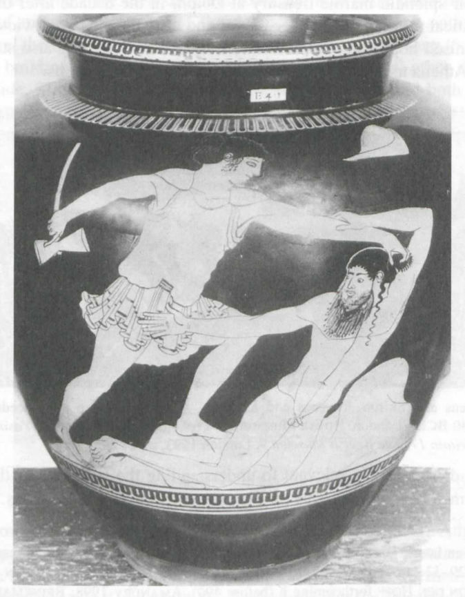
Fig. 1: Theseus and Prokrustes. Attic stamnos (around 490/80 BCE). London, British Museum E 441 (photograph courtesy of the British Museum, London).

Marathon in 490, when a victory monument for Marathon was set up in front of the treasury. Nevertheless, there are reliable reasons to separate the building of the