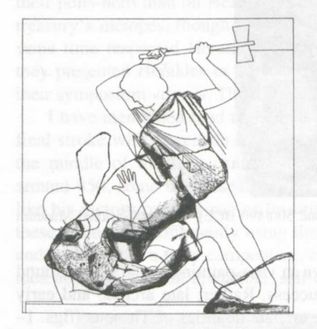
Fig. 4: Theseus and Prokrustes. Metope 2 of the Athenian treasury at Delphi (drawing after Hoffelner 1988, fig. 4).

the death of Periphetes. This is again astonishing, because Periphetes almost never appears in vase-painting cycles of Theseus' adventures, and never before around 470/60.<sup>30</sup> The reason for this choice seems obvious. According to the myth, it was only against Periphetes that Theseus used a club. The club was best known as Herakles' weapon.<sup>31</sup> Depicting Theseus and Periphetes made the Athenian hero similar to Herakles, his pendant in the treasury's metopes, as did metope 5 with Theseus and Athena.