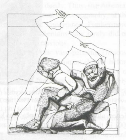
Fig. 5: Theseus and Periphetes. Metope 4 of the Athenian treasury at Delphi (drawing after Hoffelner 1988, fig. 2).

Metopes 2 and 4 are unusual in another sense. Even though much is lost of the depicted figures, Theseus' motion (metope 4) and his preserved shoulder (metope 2) strongly suggest that he was holding his weapon above his head and/or executing a final stroke. Such an attack is only possible if the attacker is fearless of any counter-strike, because the whole right side of his body is defenceless. What we could call a 'final stroke posture' is always a risk and, by the same token, a sign of high self-confidence – a signum of the attacker's invincible tolma , as Andrew Stewart also has argued. It was later adopted for the statue of Harmodios, the tyrant-slayer, in the Athenian agora (fig. 11).<sup>32</sup> Around 500 (and even around 490), to depict Theseus in this manner was unusual, though not unknown. The abovementioned lekythos (fig. 6), another lekythos with Theseus and Skiron, and an early red-figure cup are the only examples among more than 20 other images.<sup>33</sup>