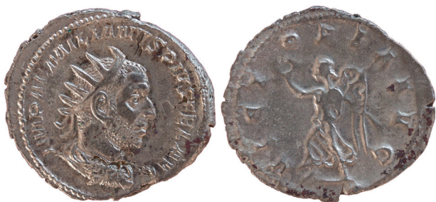
Fig. 3. Example images of the ancient data set.

The second segmentation method follows the approach proposed by REISERT / RONNEBERGER / BURKHARDT (2006) based on the Generalized Hough Transform (GHT) (BALLARD 1981). It uses three-di-