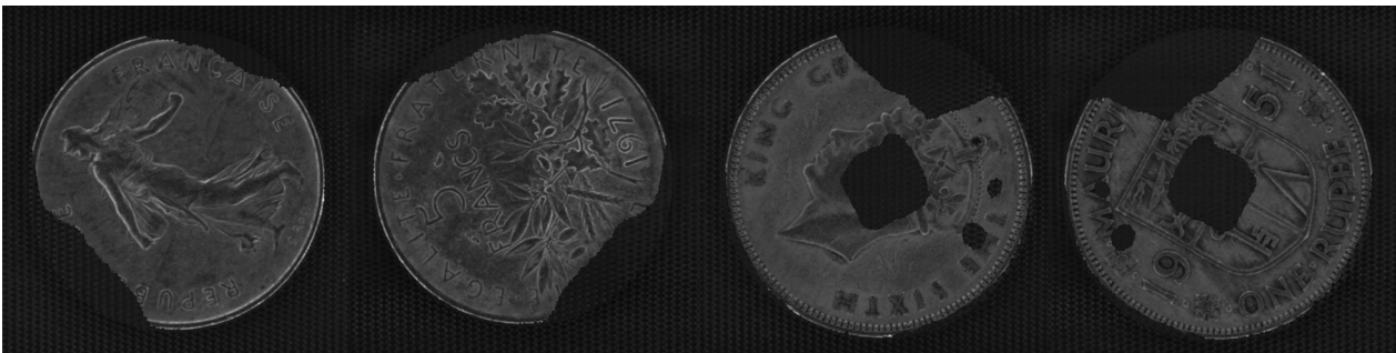
Fig. 2. Example of cropped images of MUSCLE CIS 07 dataset.

106 classes of the dataset. Furthermore, the coins are in different conditions and exhibit different level of wear and fouling. An example of a coin from the dataset is shown in Fig. 3.