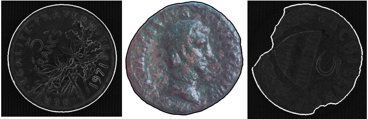
Fig. 4. Examples of coin segmentation.

mensional voting space whereas each image gradient votes for coin's centers and radii along its direction. For performance reasons, a hierarchical voting scheme with stepwise parameter estimations is applied. By definition, this method is only applicable for completely round coins. Examples of segmentations obtained using both the edge-based and the GHT method on the three different data sets are shown in Fig. 4 .