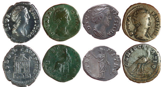
Fig. 6. Sample images from DIVA FAVSTINA.