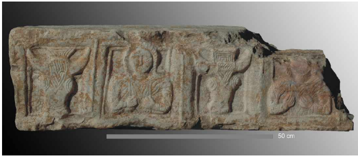
Fig. 6. Relief which depicts bucrania and women holding their hands upon their breasts (Iz09-164).