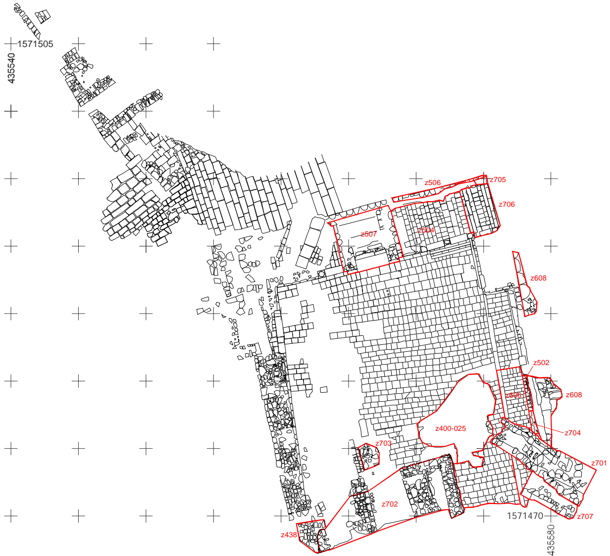
Fig. 2. Plan of this season's features.

z423 to the NE corner of the excavation trench, that is 6 m.