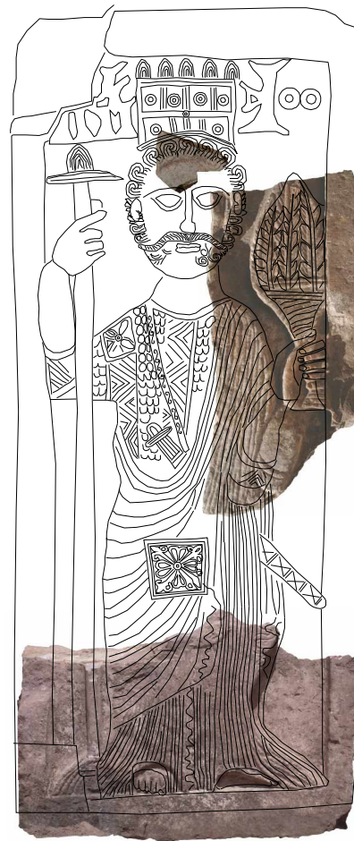
Fig. 4. Fragments of a relief figure which is depicted holding a branch bouquet in its left hand, a staff in the right one. It is shown with an undulating diaphanous garment (Iz09-376 and -398) rendered on a drawing of the crowned figure discovered in 2008.

Some 190 sculptures and such lots came to light during the course of this season. The most interesting of these includes the two large fragments of a relief figure which is depicted holding a branch bouquet in its left hand (Fig. 4). This limestone figure is identical in style, type and size with that found 5 m to the north in the season 2008 (Yule 2009; idem. in press; Michel 2009). The lowermost portion was positioned a few centimetres from its presumed original position. More exactly, it stood 5 m south of the crowned figure which was set into the E wall (z502) of