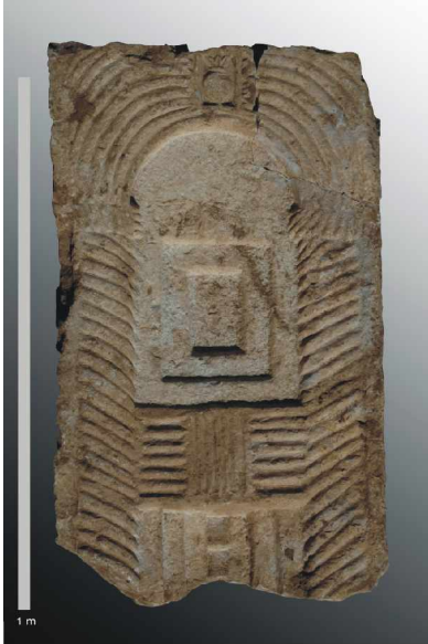
Fig. 7. Stone niche (Iz09-078.001).