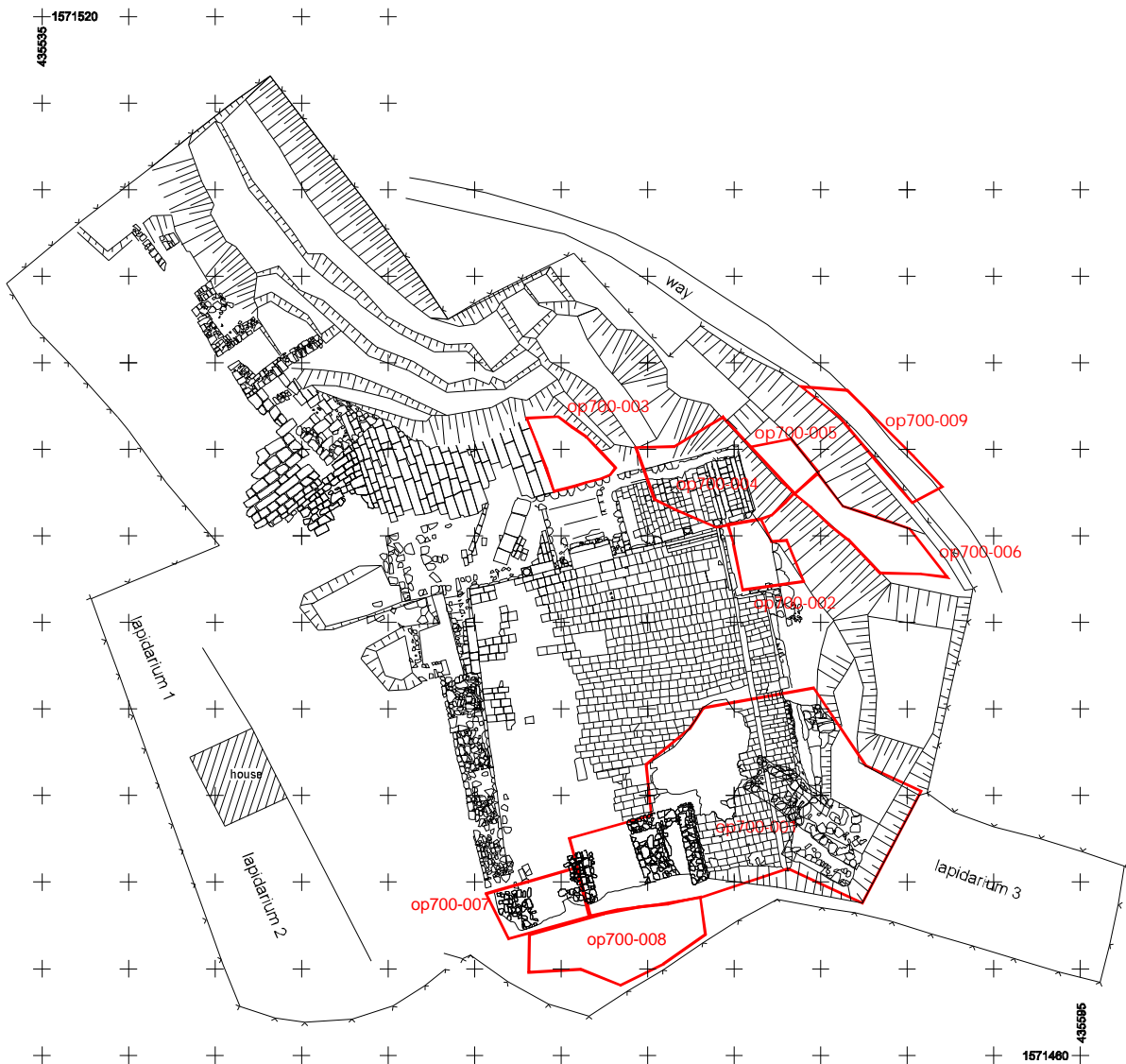
Fig. 3. Plan of this season's excavation operations.