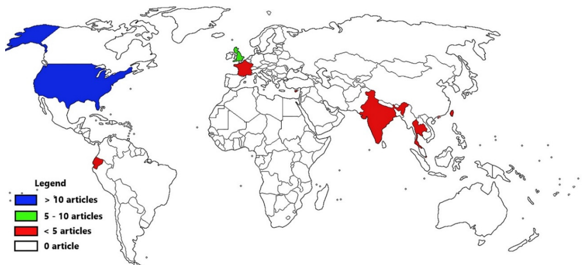
Figure 2. Map of the world showing the locations where studies have been conducted.

studies [32,49–51,53], six case-control studies [37,41,43,47,52,59], and one case cross-over study [58]. As shown in Figure 2, 63% (26) of the studies originated from the United States of America [13,23–34,40,41,43,45,46,49,50,53,55,58–61]; six studies from the United Kingdom [36,39,42,48,56,57]; two from Cyprus [35,39], Thailand [51,54], Taiwan [47,52], and Hong Kong [39], respectively. One article each originated from Germany [39], Singapore [37], India [38], and Ecuador [44], respectively. Approximately half of the studies (54.5%) utilised secondary data sources such as hospital registers and military databases.