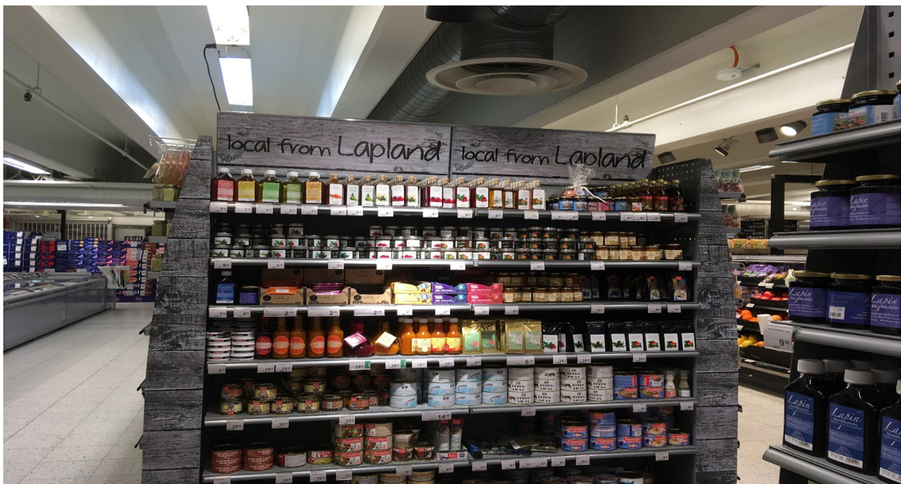
Figure 3: Sample of some local food products from Lapland at the City market, Rovaniemi.

Barley has been one of the few grains that can survive in the Arctic climate of Lapland. It is traditionally used for baking and brewing. Flatbread ‘rieska’ is baked from barley as a main ingredient; Lapin Kulta Arctic Malt non-alcoholic beer is also made from malted barley to generate a fruity flavour. Flavour can be digitalised by