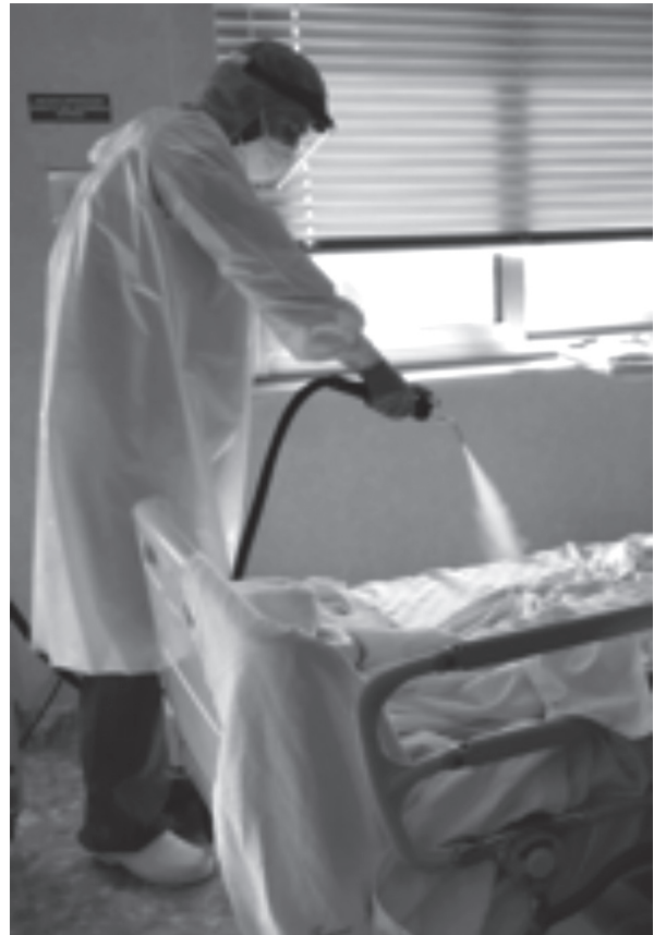
Figure 1 - Surface sanitization procedure

ordinary sanitization procedures and 12 after extra-ordinary sanitization procedures. One surface sample from an administration office was obtained outside the unit as a control sample. Eight samples were obtained from PPE: four from the inner layer of two