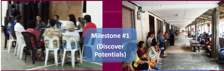
Milestone #1 (Discover Potentials)