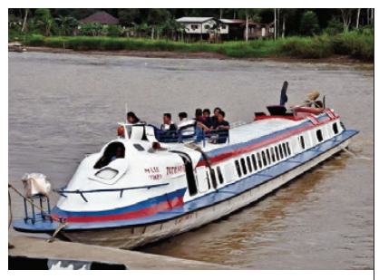
Taking an express boat from Marudi to Long Lama

The following day, approximately at 09:30am, we headed to Long Bedian using three chartered 4WD vehicles. The two-hour bumpy ride along the rough and uneven