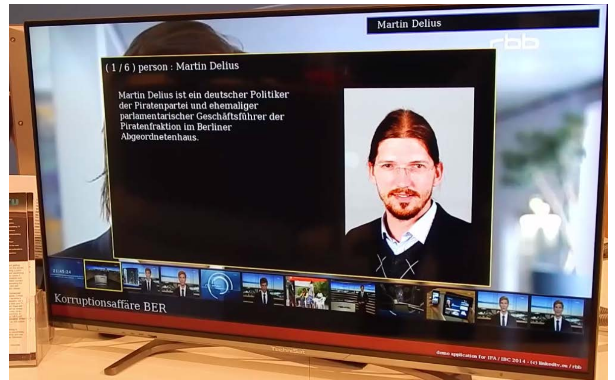
Figure 2: Screenshot of the HbbTV single screen application, showing information about a person occurring in the TV program. The user activates and navigates the information about the entities with the arrow buttons of the remote control.