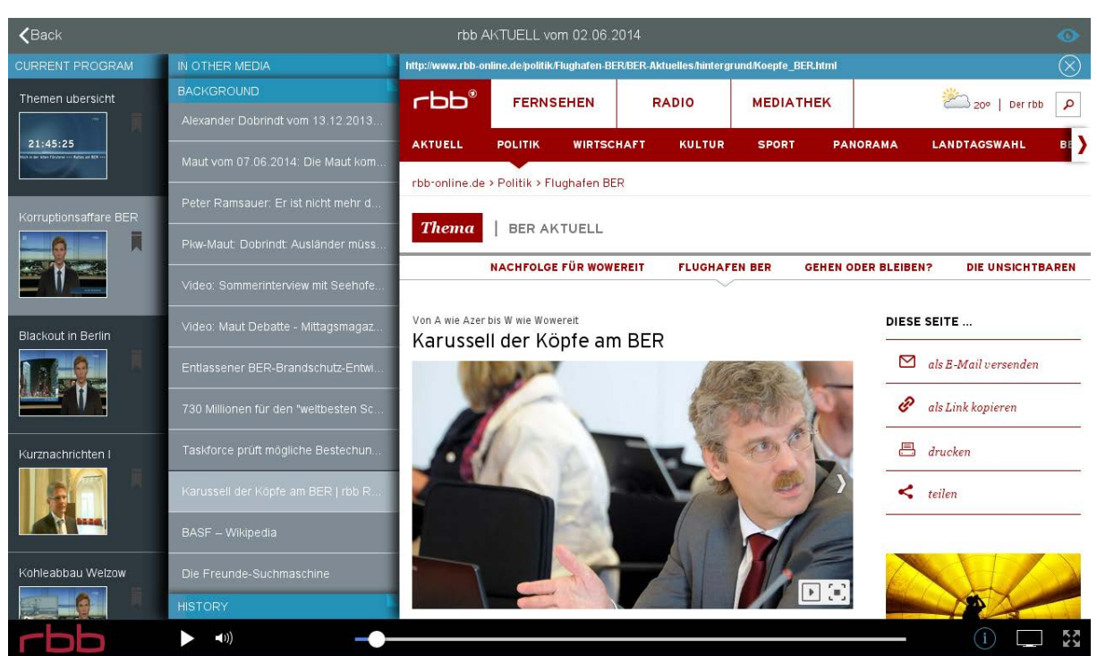
Figure 11: Screenshot of the companion application for news showing the background articles for a news item from RBB