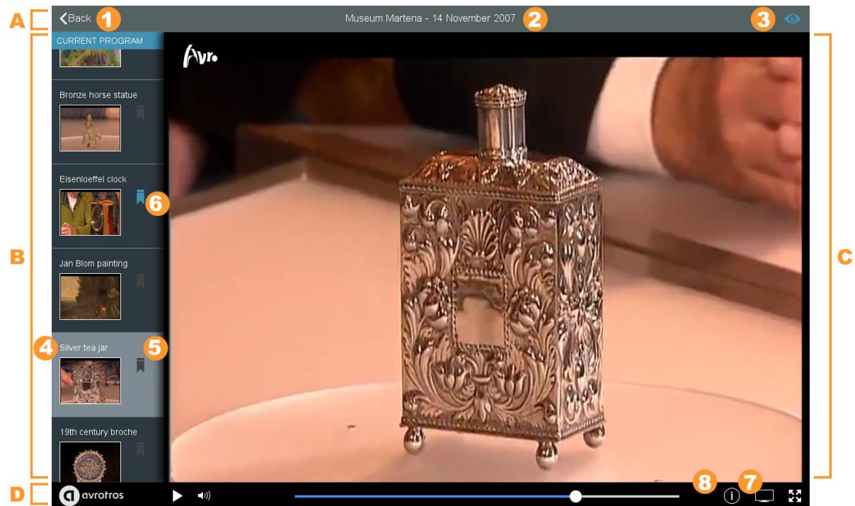
Figure 4: Screenshot of the player screen from the Linked Culture application.

The left side of the application contains a list of the chapters in the episode (B), while the chapter that is currently playing is highlighted (4). Each chapter can be bookmarked by clicking the icon next to the thumbnail (5), which turns into blue when a chapter is bookmarked (6). The chapter list allows the user to quickly navigate through the video, i.e., by selecting a chapter the video seeks to the starting point of that chapter.