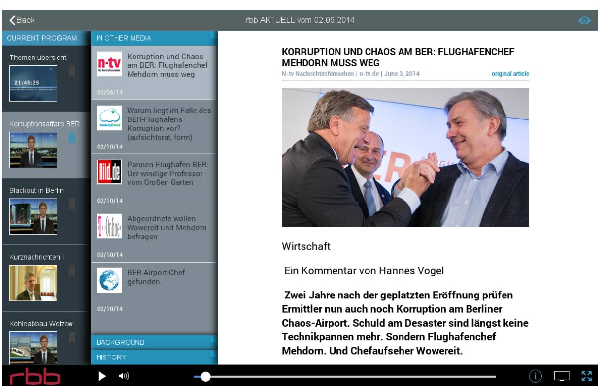
Figure 10: Screenshot of the companion application for news with the "in other media" dimension activated.