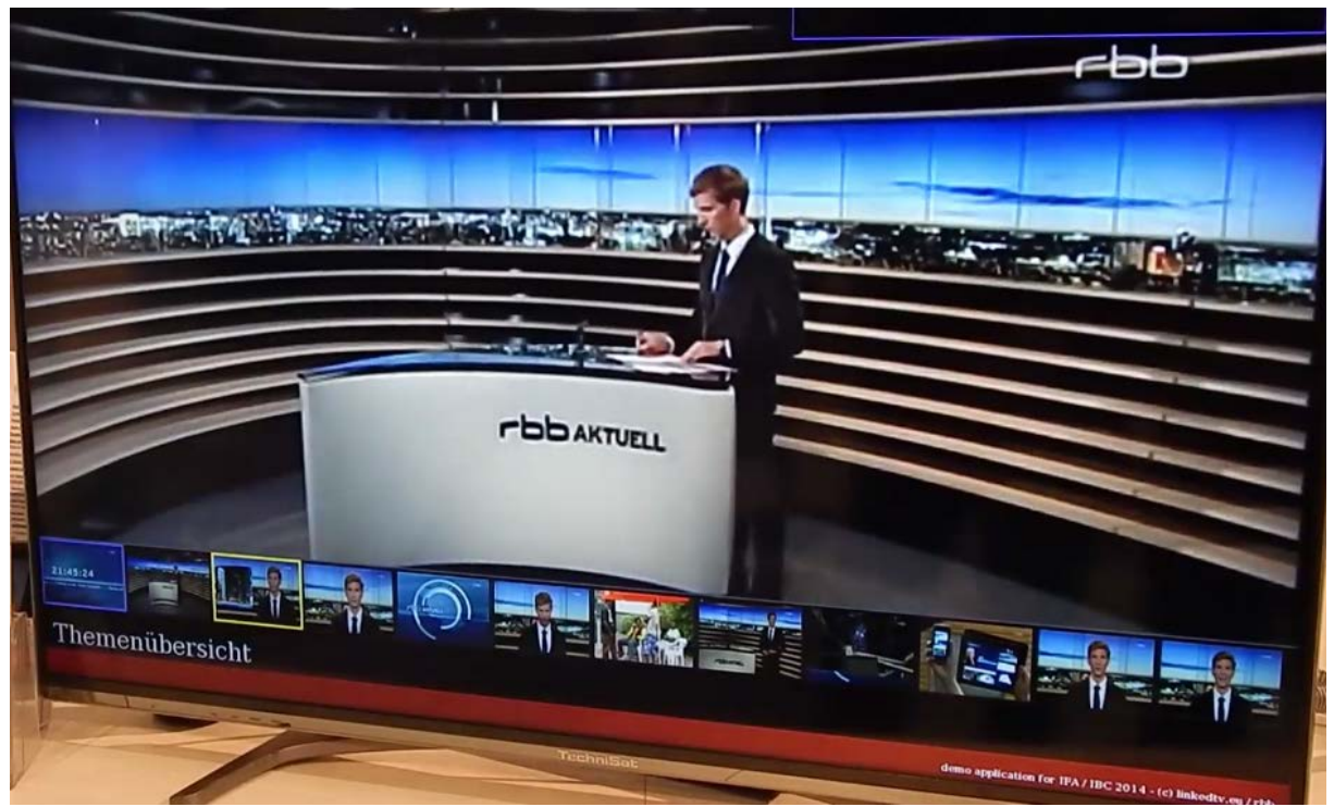
Figure 1: Screenshot of the HbbTV single screen application, showing the chapters of an RBB News program. The user activates the overlay with the remote control and navigates and selects the chapters with the arrow and enter buttons.

This interface is suited for the News and Cultural Heritage domains to provide information about the main entities in the program.