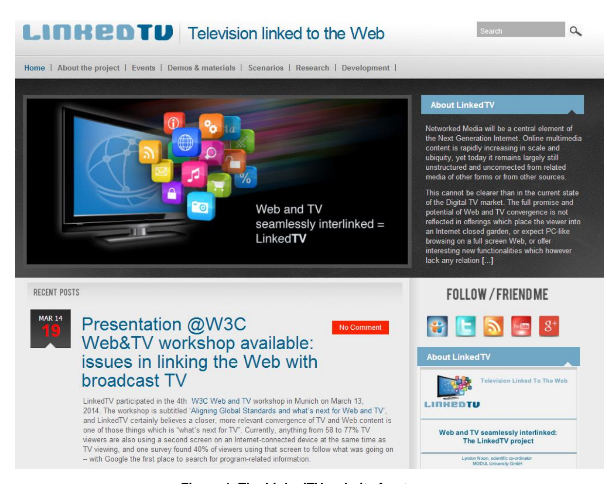
Figure 1. The LinkedTV website frontpage