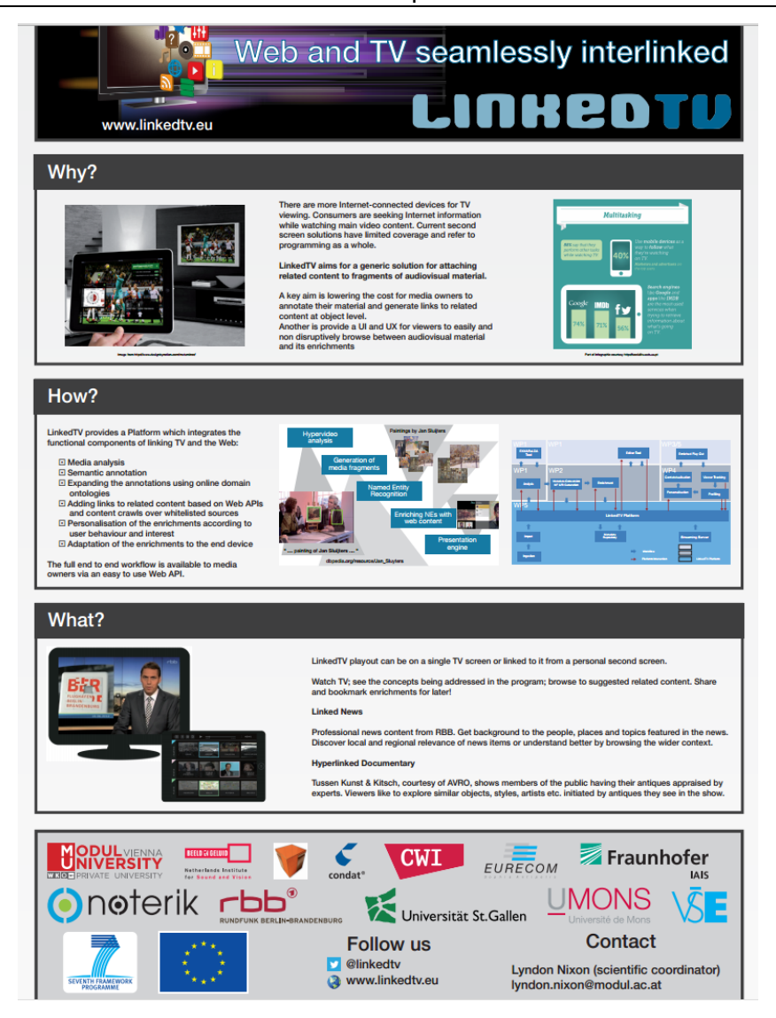
Figure 3: The LinkedTV Poster