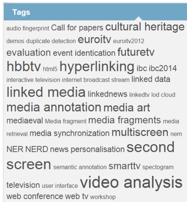
Figure 2: News items tag cloud