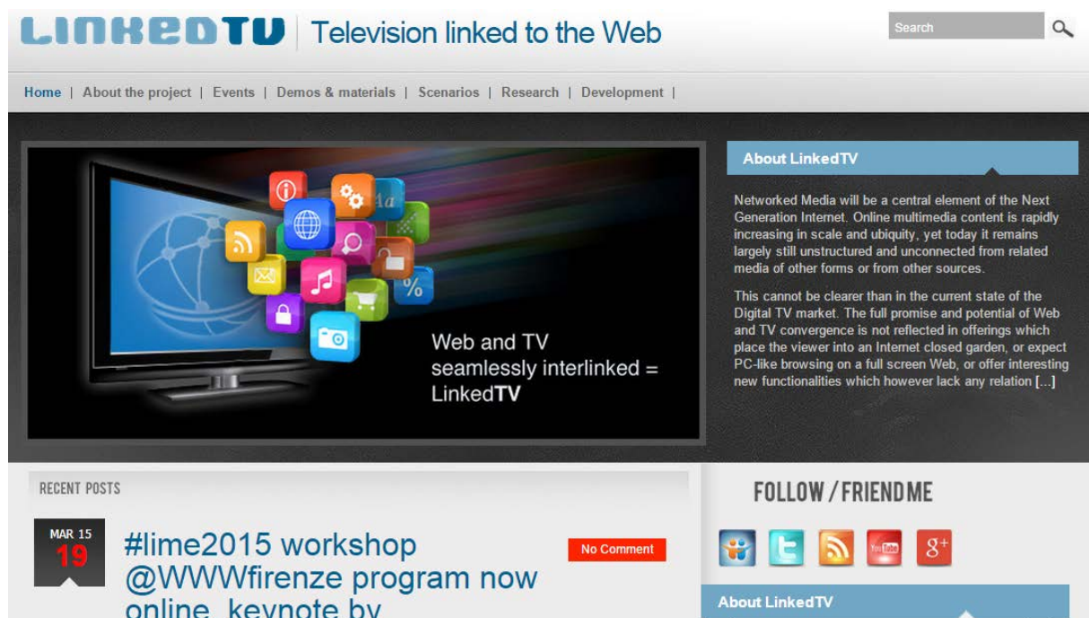
Figure 1: The LinkedTV website front page

The website at www.linkedtv.eu (Figure 1) has been introduced in deliverable D7.1: LinkedTV website.