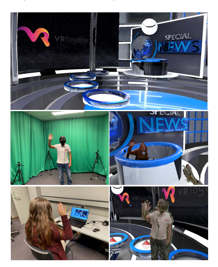
Figure 1: Virtual space, studio setup, portable setup and participant viewpoints

MMSys'20, June 8-11, 2020, Istanbul, Turkey