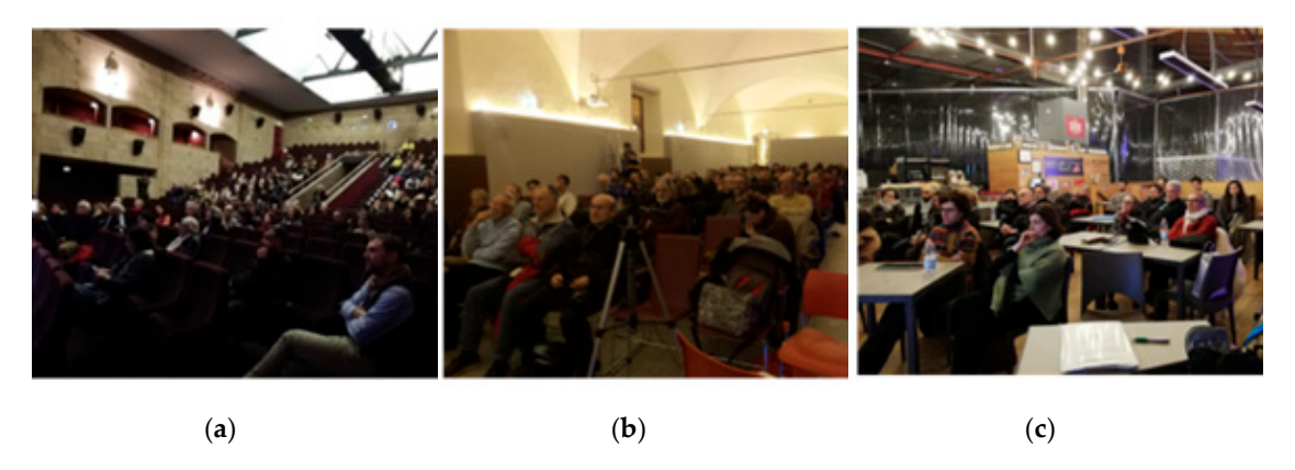
Figure 1. Different modalities of Science cafés: (a) in a conference room of the public Library "Oblate", in the center of Florence; (b) a Cine-science at the Cinema "La Compagnia", Florence; and (c) a science café in the Central Market of Florence.

Up to now, the Caffè-Scienza association has organized more than 300 events, with several variations: in markets, in libraries, streamed on YouTube, with online participation of experts, using movies (Cine-Scienza), and so on (Figure 1). The association also experimented with radio support (nine years) and animated the Italian Network of Science Cafés. The themes are varied, covering science and technological topics. Science cafés have also been used as an instrument for evaluating and discussing the results of European projects, as well as to co-design new ones.