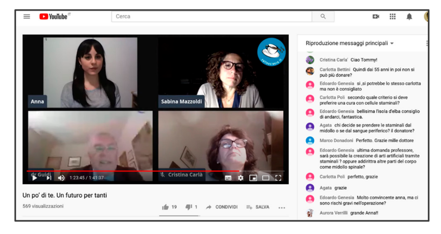
Figure 4. A moment of the Science Café demanded by the high school.

Both events went well, with a large participation of students (more than 100 participants) who animated, with their questions and comments, the chat and the discussion (see, for instance, [27] with about 50 comments). The teachers were satisfied with the success in terms of numbers and participation.