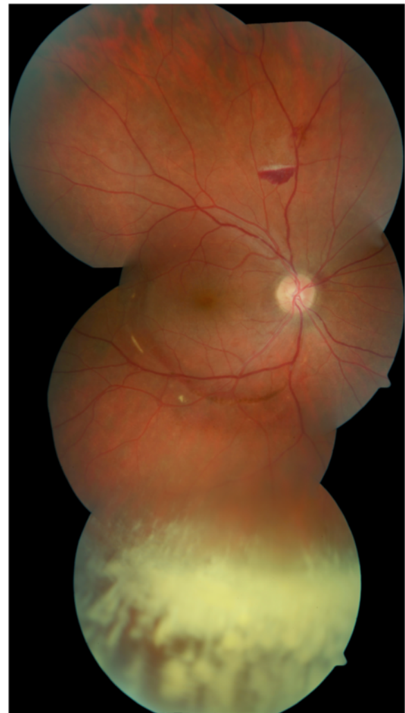
Figure 3 Right eye fundus image 3 months after initial presentation. Complete resorption of central retinal hemorrhages and remnants of vitreous hemorrhage inferiorly.

This case report demonstrates that massive retinal and preretinal hemorrhages in Wegener's granulomatosis can resolve under immunosuppressive therapy. Despite the lack of acute signs of vasculitis, particularly fluorescein extravasation in angiography, severe vasculitis-like retinal