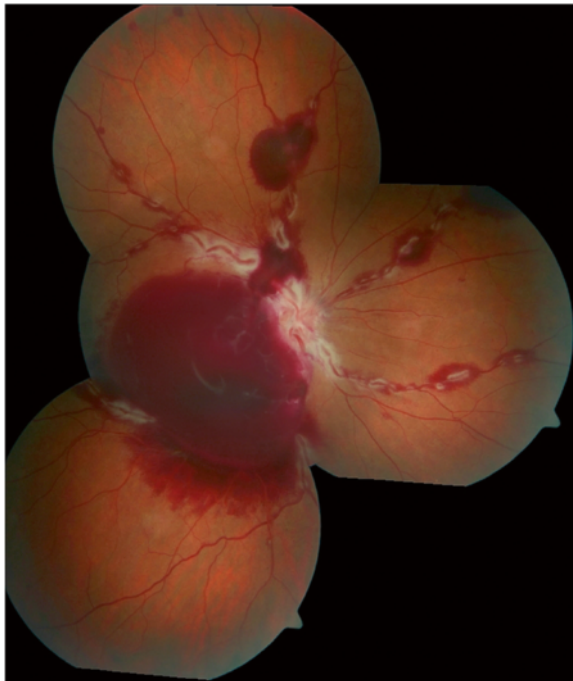
Figure 1 Right eye fundus image at first presentation. Dilatation of retinal veins, retinal and preretinal retrohyaloidal hemorrhages and segmental perivascular changes.

segment showed a hyperemia of the conjunctiva, while fundus examination was unremarkable.