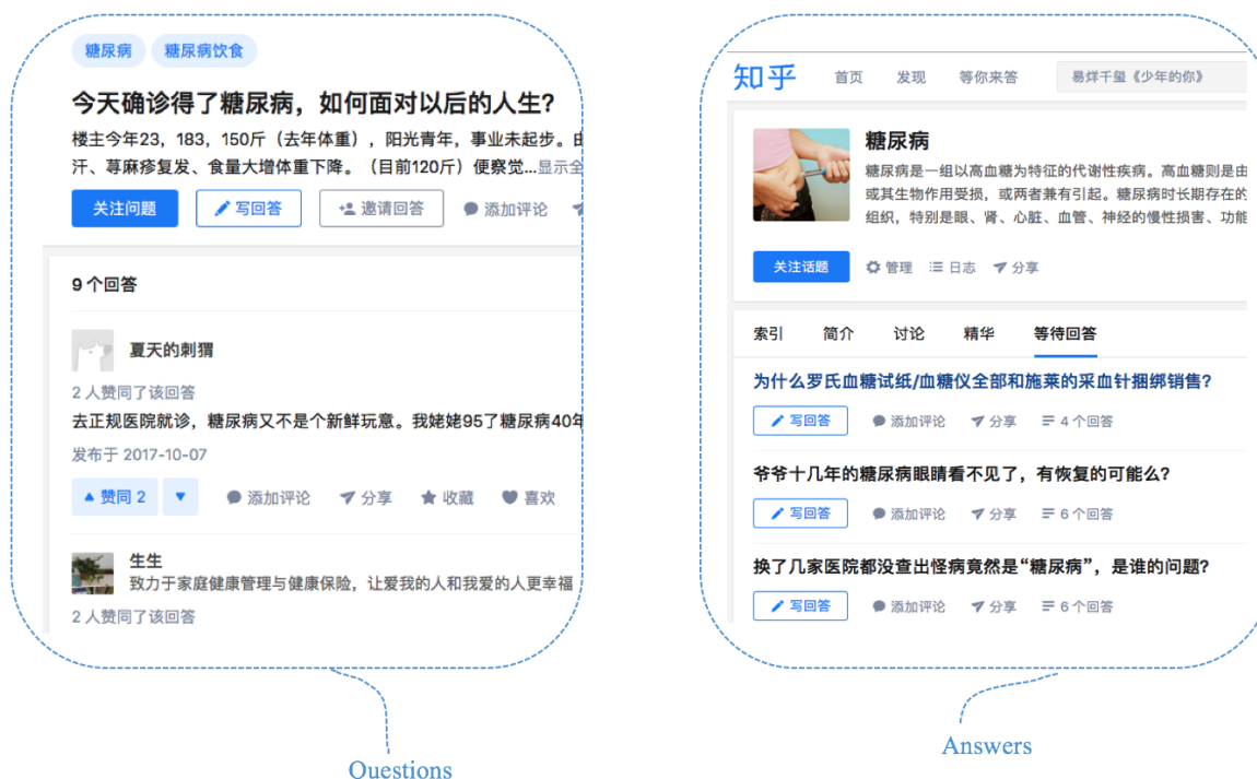
Figure 2. The questions and answers in diabetes sub-community of “Zhihu”

In order to get an overall comprehension of users’ privacy disclosure in their own generated contents, we collected all questions and corresponding answers from 4 sub communities of “Zhihu”, the subject of which is diabetes, and including diabetes subtopics, insulin, diabetic diet, diabetic complications as well.