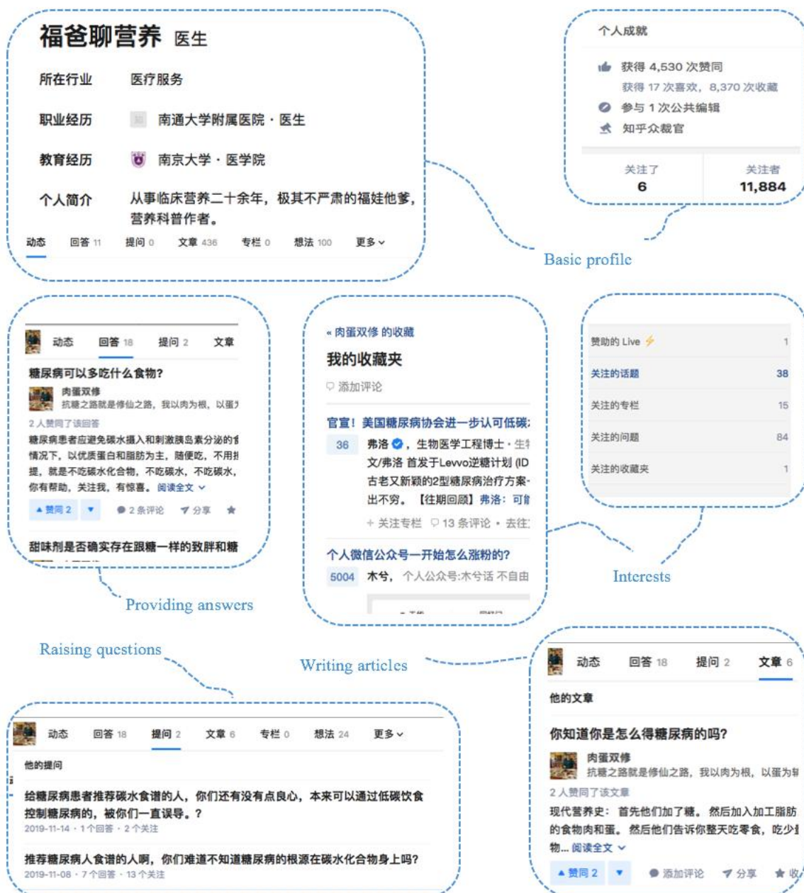
Figure 3. The main activities of people in diabetes sub-community of "Zhihu"