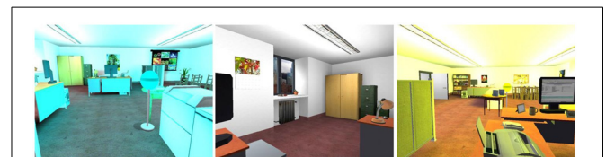
FIGURE 1 | Virtual office illuminated in two different lights (right in blue and left in yellow) which served as conditioned stimuli (CS) and with normal illumination (ISI, inter-stimulus interval).

At several times during the experiment, ratings of valence (from “very negative” to “very positive”), arousal (from “not arousing at all” to “very arousing”), fear (from “no fear” to “extreme fear”),