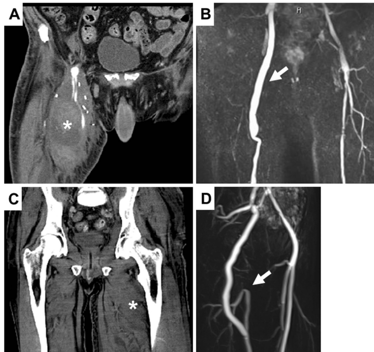
Figure 1 (A) Computed tomography scan of case 1 obtained after rebleeding due to septic pseudoaneurysm showing liquid, putrid formation (asterisk) with arterial extravasation caused by erosion of the distal anastomosis of the greater saphenous vein interposition and extensive perifocal soft-tissue edema in the right upper thigh. (B) Magnetic resonance angiogram of the obturator bypass in case 1 nearly 3 years after bypass surgery showing bypass perfusion free of stenosis (arrow). Case 2 (C) Computed tomography scan of case 2 at time of admission showing swelling, subcutaneous purulent formation and perifocal edema (asterisk). (D) Magnetic resonance angiogram obtained 3 months after surgery in case 2 showing the obturator bypass with retrograde perfusion of the profunda femoral artery by additional end-to-end anastomosis with proximal superficial femoral artery (arrow).

together with rhabdomyolysis and sepsis with liver and kidney failure (Figure 1C). Massive gangrenous destruction of the femoral vessels and surrounding tissue were found intra-operatively, pending sufficient coverage of an orthotopic revascularization (Figure 2A). Group B Streptococcus was identified.