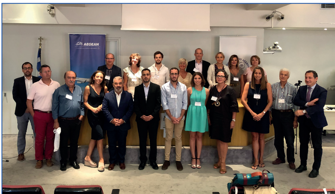
Some Participants at 11th OTIE Conference on Islands Tourism, Mytilene, Lesvos - Greece 5th–6th Sept. 2019

OTIE has organised training and educational activities since 2011, such as the International OTIE Summer School, involving students and teachers coming from different countries. The course has a practical orientation and is structured around theoretical lessons and practical sessions, where the students undertake project work which they present and discuss during the closing ceremony in the presence of local authorities and operators. This facilitates practical skill development and know-how and not only traditional and theoretical knowledge.