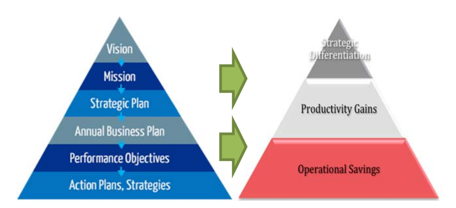
Figure 1: The progression of the traditional marketing pyramid to Owyang's [16] pyramid with the mission pyramid suggested by Chaffey [17] as a comparison.