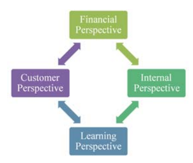
Figure 5: Measuring social media ROI using a balanced scorecard.

In relation to the BCG matric and performance tracking and measurement, this is used by the airlines that were interviewed for this study. Shaw [22] confirms the use of Ansoff and BCG matrices to be industry standard. This measurement is more pre and post consumption analysis in relation to CRM. The airlines monitor the physical traffic to Ireland from North America and the virtual engagement with the company through social media channels. This then gets correlated with ROI to predict what the next viable North American route to Ireland might be. The reality of this approach is the flexibility of the airline business in terms of flight origin.