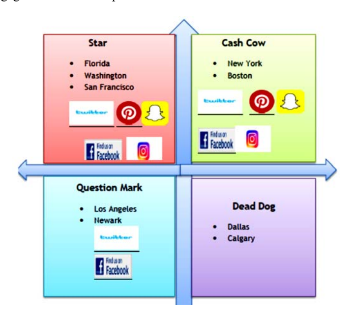
Figure 6: BCG Matrix using social media activity as a performance analysis.

Fig. 6 highlights the flexibility of the Irish airline companies when monitoring ROI through social media activity. The interviewees of this study believed that social media engagement directly indicated where destination purchase may emanate from using this measurement. In this example the routes with the least amount of social media engagement generated little ancillary sales. This model reveals KPIs such as ROI, brand awareness, consumer engagement and future purchases.