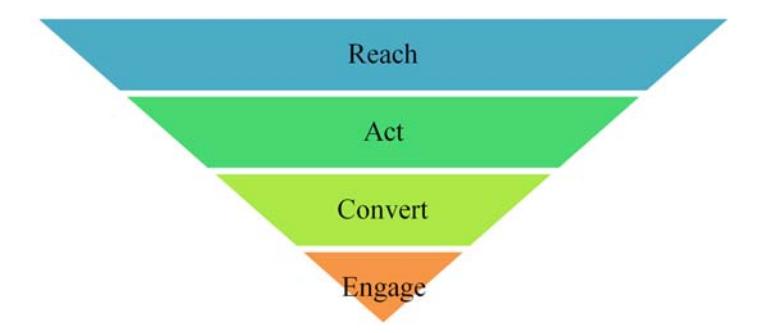
Figure 4: Chaffey's [9] process of social media promotion.

films and social media as a brand positioner. In terms of ROI this pertains to customer lifetime value where the North American further associates the brand with pop culture. The interviewees of this study believe that this creates a desire among North Americans to want to travel to Ireland. When the brand achieves its position this way across social media channels, shares, likes and comments create a customer lifetime value (CLV), this in terms of social media is harder to calculate. The empirical wisdom of this study reveals this to be 5% per customer per day basing the calculation on a 28 day social media cycle. However, this is only suggestive and metrics like awareness, engagement, unique visits and return visits are far more valuable when measuring brand health and positioning.