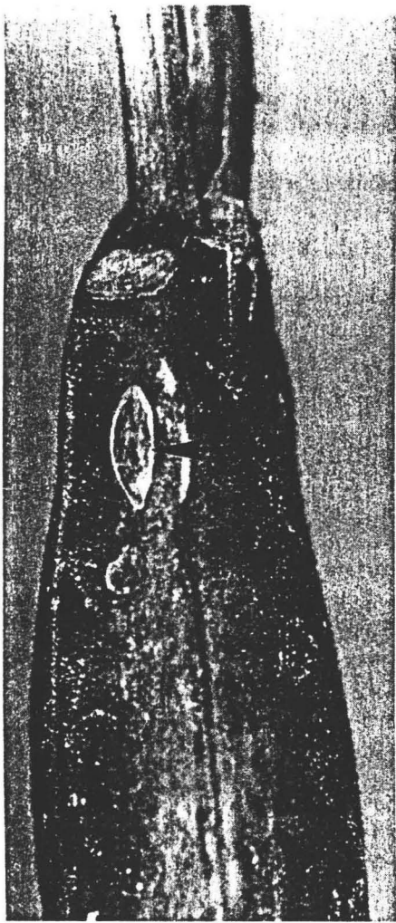
Fig. 2. Domatium entrance slit at the upper end of an internode which did not fully open (see arrow; greenhouse plant; sizes are given in the text).