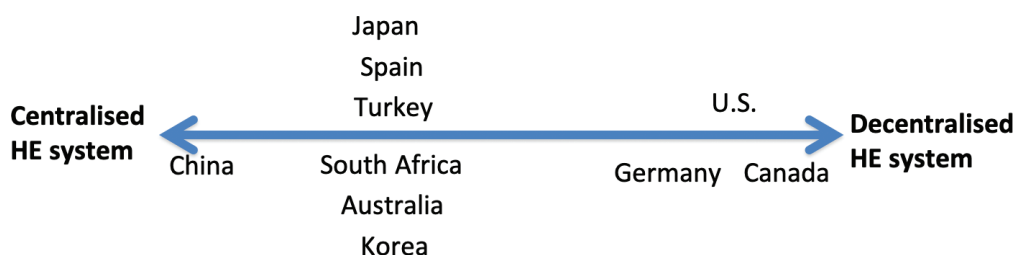
Figure 3: Spectrum Centralised HE system-Decentralised HE system.

Our first research question focused on the influence of country-specific contexts on the development of national / state-wide infrastructures for the dissemination of (O)ER in HE. The comparison of the different situations in the countries shows that, in order to understand HEI (O)ER infrastructure (or the lack thereof), the level of political structure centralisation should be examined as a cornerstone element of the cultural context, as this also influences the structure of the HEIs (see Figure 3).