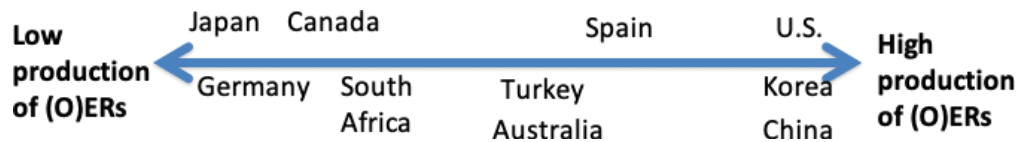
Figure 4: Spectrum Low production of (O)ER - High production of (O)ER.

two of the most popular OER initiatives in HE. The U.S., South Korea and China are high producers of (O)ER, whereas countries such as Japan and Germany are producing less OER at the national level, despite their position in the IDI 2017 rank. Furthermore, Canada and the U.S. are considered the OER pioneers, and many of their initiatives have been popularised and replicated in other countries. Examples are the Canadian Connectivism and Connective Knowledge MOOC (2008) and the popular U.S. MIT Open Courseware (2001).