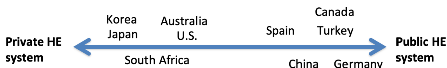
Figure 2: Spectrum Private HE system - Public HE system.

The differentiation between private and public HE systems is also relevant in understanding the differences between these countries (see Figure 2). On the extreme left of the spectrum, approximately 80% of HEIs in South Korea and Japan are private, and so too are around 62% of HEIs in the U.S., both non-profit and for profit. In South Africa, only 23 out of 143 HEIs are state-funded and the rest are private (84%). On the other extreme of the spectrum, the majority of German and 75% of the Chinese HEIs are state-funded, with HEIs in China affiliated with the Chinese Ministry of Education, with other ministries or with provincial governments. Turkey and Spain have a higher number of public HEIs than private ones: Turkey has 129 public universities, 71 non-profit foundation universities and 5 foundation vocational schools, whereas Spain has 2,230 public HEIs, 50 of which are universities 1 , and 34% of the HEIs are private (n = 1,145, 34 universities).