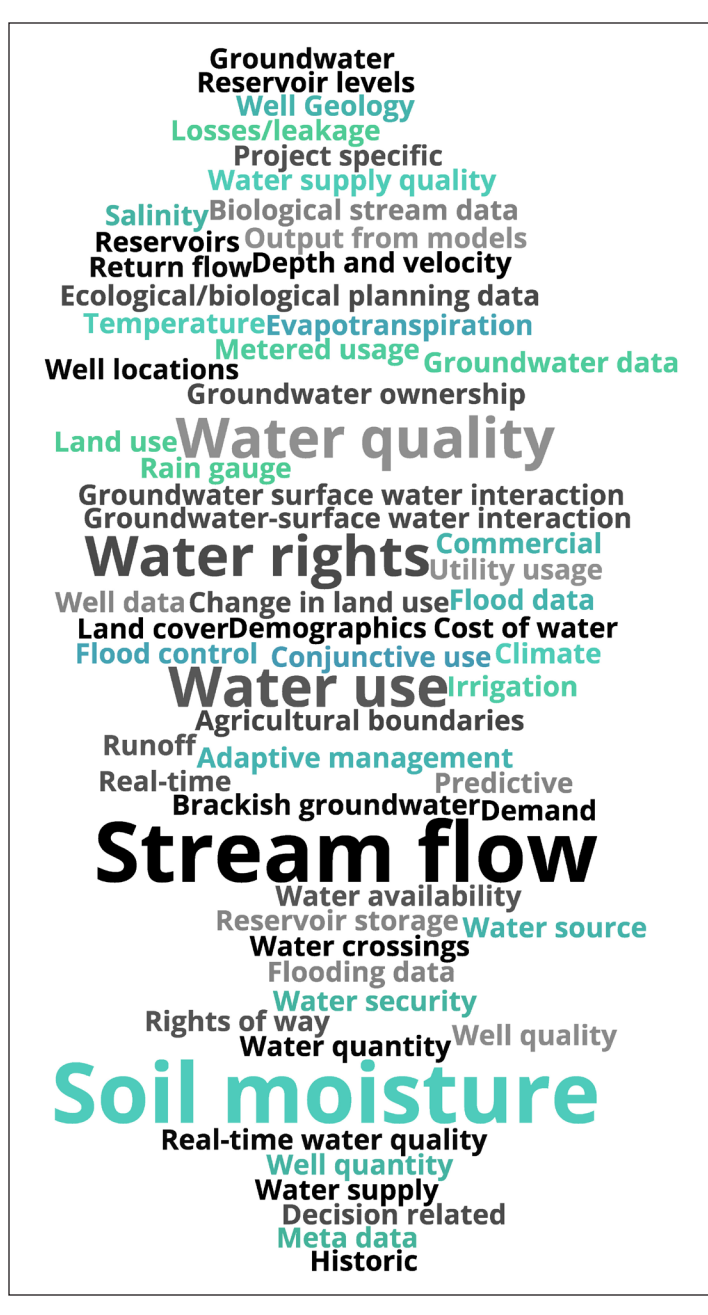
Figure 3. Responses to the question "What kind of data are needed?".

as well as socio-economic and policy challenges. Those five use cases are: