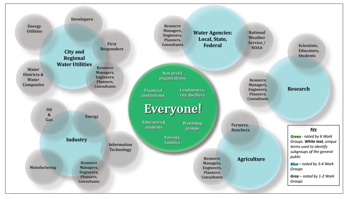
Figure 2. Responses to the question "Who needs data?" aggregated by users associated with each major use category. (Large circle noted by six workgroups, medium by three to four, and small by one to two workgroups.)

Participants were then asked to describe the purposes for which data are most needed. There were about 50 different responses with very little overlap. A wide diversity of interests of participants is not surprising given the wide variety of purposes for which data are needed and the situational, geographic, and temporal variability of water-related decisions. Responses ranged from general purposes, such as understanding how much water a person uses or how clean one's water is, to highly technical purposes, such as making flood risk determinations and updating water availability models. All recommendations are available for review in the workshop detailed summary (<u>Rosen and Roberts 2018</u>).