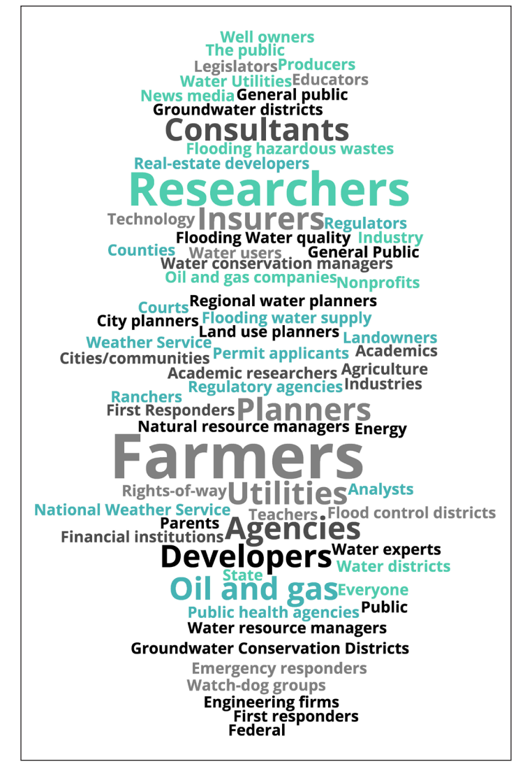
Figure 1. Responses to the question "Who needs data?". Size of each word indicates the frequency of mention in the reporting of the workgroups.

To help draw meaningful connections, we diagrammed how many workgroups mentioned users associated with major categories of use, such as for "agriculture," and also added specific user groups, such as "engineers" and "first responders" that workshop participants associated with those categories (Figure 2). The connection between all water users is indicated by the center circle, with different terms listed in the circle used by the