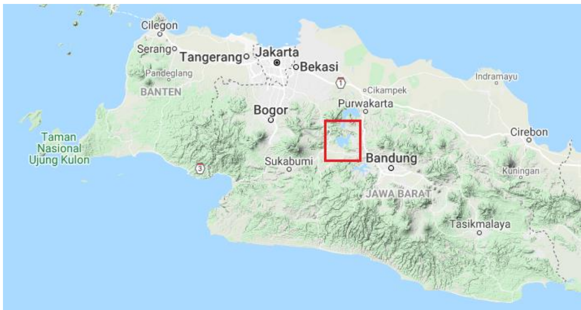
Figure 1-1: Location of the study area, Cirata dam, a large reservoir located on upstream Citarum, West Java Province.

Sentinel-2 data are acquired on 13 spectral bands in the VNIR and SWIR, with four bands at 10 m: 490 nm (B2), 560 nm (B3), 665 nm (B4), 842 nm (B8); six bands at 20 m: 705 nm (B5), 740 nm (B6), 783 nm (B7), 865 nm (B8A), 1 610 nm (B11), 2 190 nm (B12); and three bands at 60 m: 443 nm (B1), 945 nm (B9) and 1.375 nm (B10) (ESA, 2015) (Table 1-1).