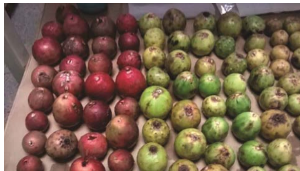
Fig. 1 — "Xoconostle" "pitaya of August" or "sweet tunillo" collected in the Mixteca zone from Oaxaca in the San Juan Joluxtla región.

Chemical description and potential for obtaining pigments. As can be observed the red tunillo has higher content of pigments, which makes it the best candidate to obtain betalains. The purple and orange tunillo showed different coloration due to the ratio of betacyanins and betaxanthines, this condition