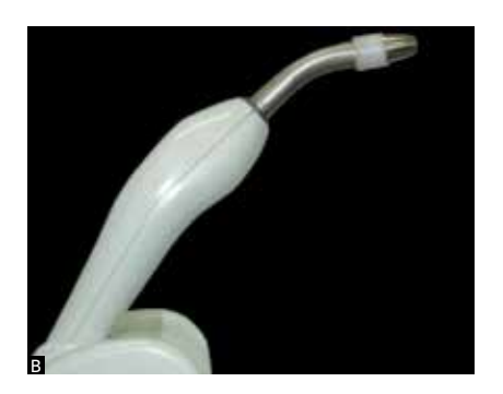
Figure 2 - A) Halogen light curing unit with coupled tip; B) LED curing unit with coupled tip.