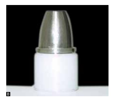
Figure 1 - A) Upper view, B) Lateral view of the new developed tip.